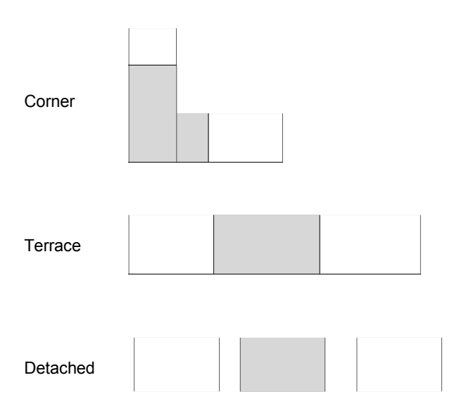
Figure 2. Pub plans

As the focus in this article is on Liverpool pubs, classification of the house style is necessarily limited. Figure 4 shows a 'classic' example drawn from