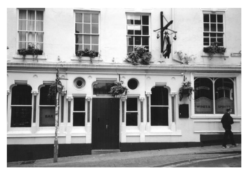
Figure 9. Old Angel Nottingham - side view (author).

and 16 Cook Street.<sup>50</sup> The consistent visual design of outlets thus mirrored the consistency given by the application of direct management, with its focus on tight discipline enforced by a hierarchy of house inspectors. The success of direct management became clearly visible in the spreading empire of outlets which Walker opened across the city. The focus in these outlets was quite clearly on the Walkers 'brand' in the manner of some early 21st century chains of managed houses.<sup>51</sup>