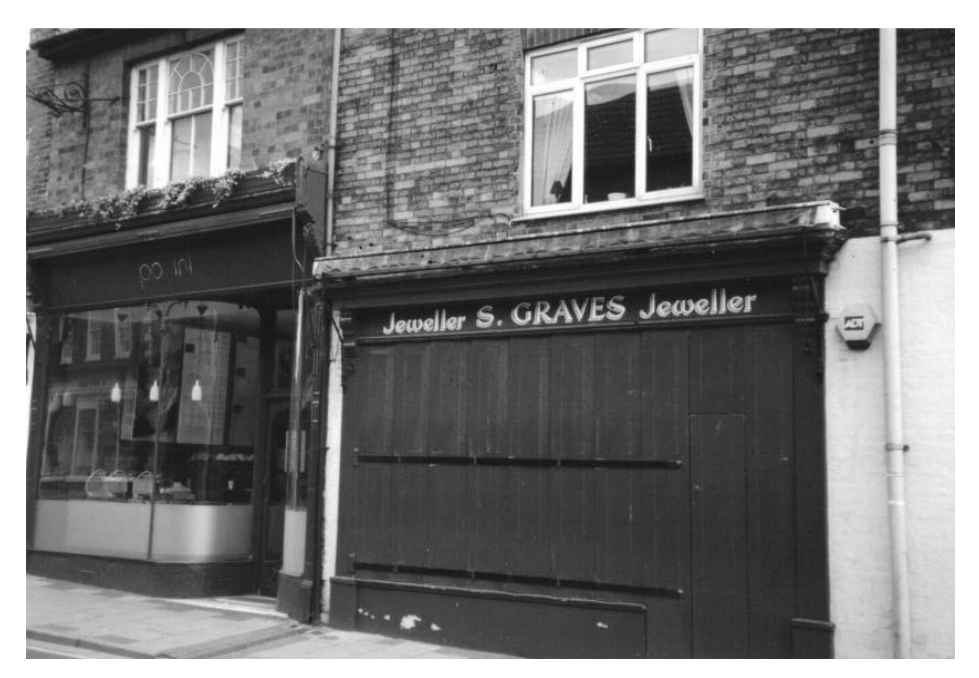
Figure 5. Shop fronts in Grantham showing increase in height and area devoted to windows (author).

examples of the contemporary fascination with the Gothic. However, if we simply focus on the straight headed variety, then we could suggest that another distinguishing feature is the depth of windows. In retailing practice the focus was on the vertical extension of windows in both directions - so that they extended to internal ceiling level in one direction and nearly to the ground in the other. Facilitated by the development of plate glass and other structural features (such as cast-iron framing) we can see a number of such large windows in the Liverpool record. However, there are