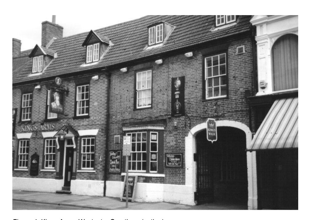
Figure 4. Kings Arms, Westgate, Grantham.

The first level of our classification refers to the form of the windows. In the classic shop these are straight headed, although it is possible for variations in the character of the head of the window to be found. This elaboration of window shape is perhaps more found in the 'house' type, with the adoption in some