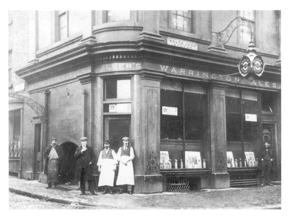
Figure 7. Custom House Hotel, Liverpool. From O'Connor, 1995, 78. Reproduced by permission of the Bluecoat Press.

in 1869. This combination of market conditions and regulatory change produced a very competitive market in which a retailing orientation was suggested. That is, most pubs when owned by brewers were run more as outlets for the distribution of beer than with the attention to customer demand which might characterise retailing. <sup>46</sup> A document put out by Peter Walker & Son to celebrate 50 years in business presented an explicit and forthright explanation of their 'managerial system' in the context of retailing.