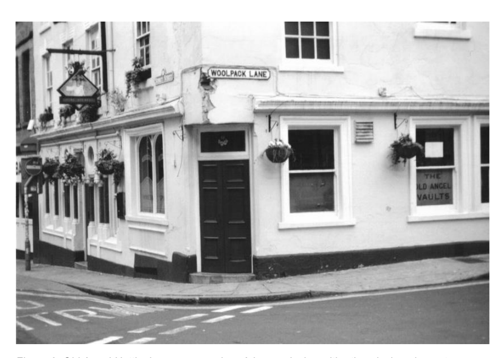
Figure 8. Old Angel Nottingham - corner view. A house design with other design elements (Gothic windows on the left) grafted on (author).

a common visual image relatively cheaply and Walker seems to have done this by borrowing techniques from retailing. We might note here that beerhouses were also known as 'beershops' and that O'Connor has several examples of very simple shopfronts employed in such establishments. However, Walker added something more to these, drawing in particular on developments in plate glass to feature very tall facades with extensive windows which created an impressive appearance. In this he and his designers may have been drawing on the strikingly modern use of cast iron and glass in the design of offices such as Oriel Chambers