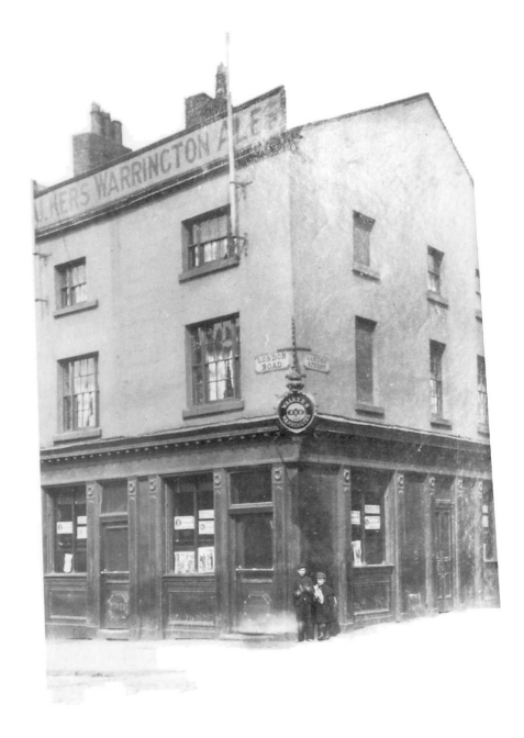
Figure 6. Camden Street Vaults, Liverpool. From O'Connor 1995, 50.

For the purpose of our analysis the simple categories of deep, medium and shallow will be employed, medium being taken as windows ending at the same height as the window glass in doors, which tended to be fixed at waist height.