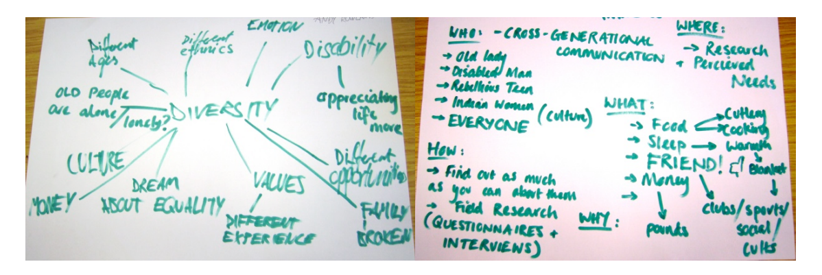
Figure 1. Mindmaps produced by the group in the 'Step into my World' workshop

Family the old lady doesn't have any and the guy with the hoody didn't look like he appreciated his family..... His angry because......yeah that's true broken family..... There's five different stories in that presentation I mean.... maybe you can link them together (2<sup>nd</sup> year BSc student).