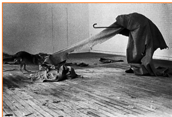
Fig. 2. Joseph Beuys – I like America and America likes me! (1974). Performance with a coyote and felt.

I like America and America likes me! is one of Joseph Beuys's better-known “actions” performed in 1974 on his first encounter with the American art scene. The artist spent three days in a gallery with a coyote, gathering a felt blanket around him to suggest the figure of a shaman or of a shepherd. The coyote changed behaviour during the three days, from cautiousness to aggression, trying in some occasions to attack the artist. The artist would protect himself from the coyote with the help of the felted cover. The performance makes references to Native American culture and the use of the felt is related to the idea of trauma and healing.