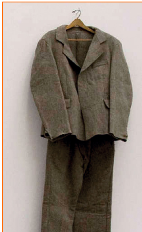
Fig. 3. Joseph Beuys – Felt suit (1970).

Felt suit is part of a series of actions that Beuys defined as a combat against the elitism of the art world. The use of humble materials was part of his strategy. Joseph Beuys wore the suit during the performance Action the Dead Mouse / Isolation Unit from 1970 and referred to the suit as an extension of the sculptures he made with felt, where the insulating properties of the material were integral to the meaning of the work, describing a “spiritual warmth or the beginning of an evolution” (Beuys, 1970).