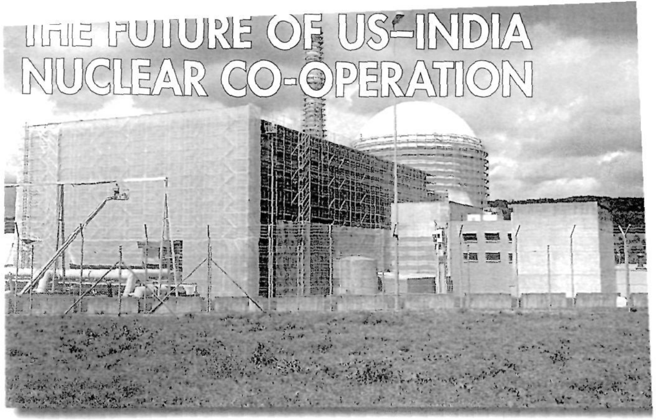
A 500 MW prototype nuclear power station at Kalpakkam, India

Sagarika Dutt suggests that the October 2008 'deal' has strengthened the nuclear non-proliferation regime.