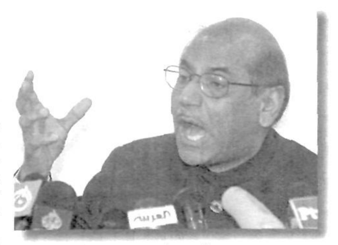
Indian Foreign Secretary Shyam Saran

In March 2006, during President Bush's visit to India, another joint statement was released expressing 'satisfaction with the great progress the United States and India have made in advancing our strategic partnership to meet the global challenges of the 21st century' and the intention to 'expand even further the growing ties between [the] two countries'. The joint statement put emphasis on economic prosperity and trade, energy security and a clean environment and also global safety and security. On the issue of nuclear co-operation the statement 'welcomed the successful completion of discussions on India's separation plan' and looked forward to the full implementation of the commitments made in 2005. It also welcomed the participation of India in the ITER initiative on fusion energy as an important step towards the common goal of full nuclear energy co-operation. But there were several anti-American demonstrations during Bush's visit, which indicated that some sections of the Indian public did not sup-