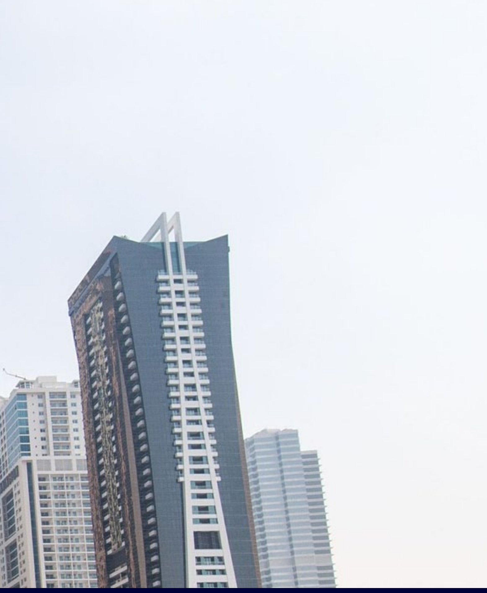
The Middle East Competitiveness Report: Regional and Territorial Analysis