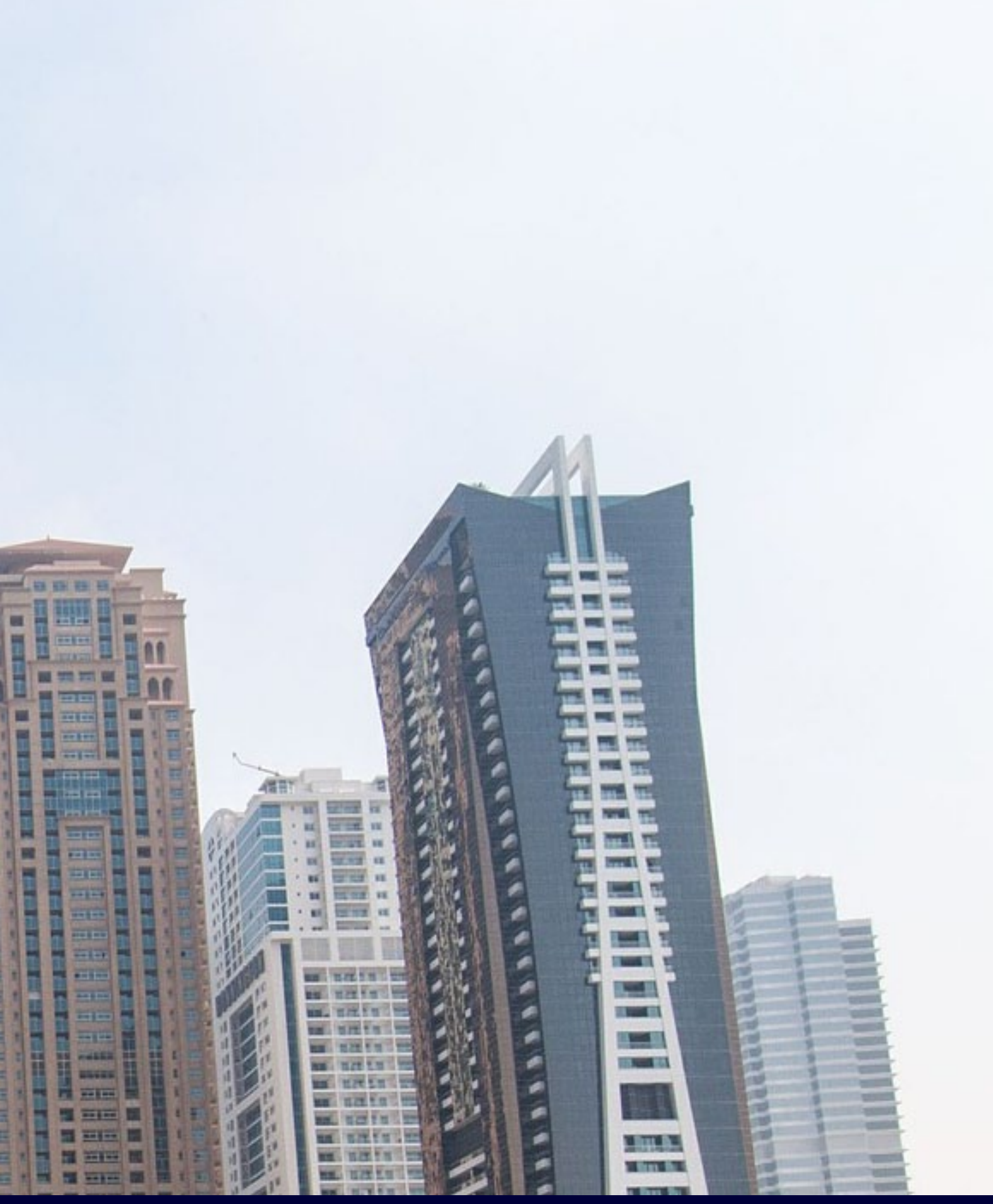
The Middle East Competitiveness Report: Regional and Territorial Analysis