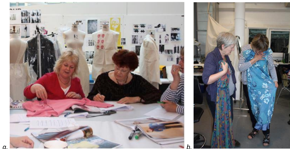
Figures 4 a-b Participants discussing their favourite items.

Alongside this activity, the participants had a chance to look at current fashion magazines such as Another Magazine, Vogue and Elle, and relate their needs and tastes to the various images, editorials and adverts presented in these publications. This provided a platform for our participants to directly compare the fashionable clothes on offer with items of clothing that are actually present in their wardrobes. Once again, for many this was a chance to express their dissatisfaction with the fashion solutions currently available on the market. On the other hand, these women presented a high level of creativity and widely commented that in fact they would buy some of these products but modify them according to their own needs, for example, by adding sleeves or elongating the shape of a garment. Overall, the