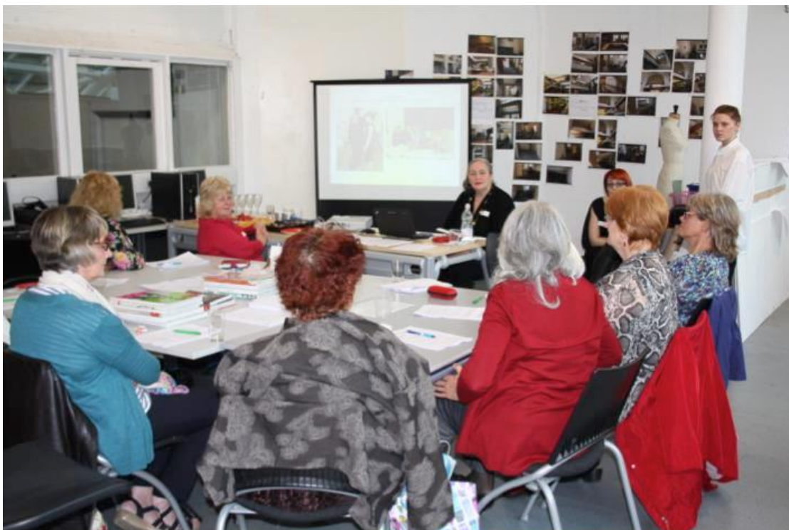
Figure 2: Participants introducing discussing their clothing preferences.

They also related to the skin, and its changing texture, density and decolourization through ageing. The participants also felt that the colours widely available in the shops often did not compliment their appearances; black and white were their classic/ regular choices, however, this was often dictated by the unsuitability of other colours rather than the participants' specific preferences. As indicated by the workshop participants, problems seemed to lie not in the colours per se but in their tonal range. In contrast, all of the women present expressed rather negative attitudes towards colours such as grey or beige through related descriptors of "granny-ish" and "boring". These shades, or 'neutrals' are considered as part of the staple colour palettes for the mature fashion market. Discussion around this issue raised interesting psychological perceptions between ageing and semantics, particularly the notion that once past a certain age women become "invisible" or "neutralised" within Western culture, perpetuated by a feeling that commercial fashion is not designed "for them".