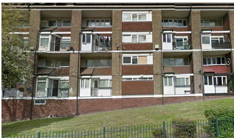
Figure 2: Maisonettes at Morley Court

The properties of four courts have brick cavity walls; but the front of each flat is made from infill panels with timber studs covered with tiles. The floor slabs are poured concrete. Windows in NCH properties are generally double glazed due to the UK Decent Homes Investment programme. Due to the building design, the top floor windows are currently shaded by the roof overhang, whilst the bottom floor of each maisonette is situated further forward on the building line and these are therefore not shaded.