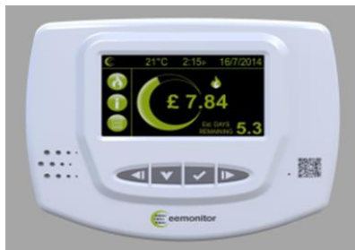
Figure 5: EE monitor

The monitor gives control to the user ensuring they have the information they need to budget for and manage their energy consumption. As a prepayment device, it protects people from fuel debt as they pay for their energy usage upfront. The device has been developed with flexibility for the user as a key feature. There are multiple payment and emergency credit options to suit the needs of the household. Heat can be paid online, on the monitor itself with a credit card, over the phone, in Pay-Point outlets; and there is also a standing order facility.