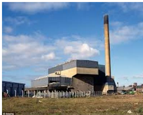
Figure1: Eastcroft Incinerator in Nottingham

Heating mains are rated for temperature up to 140°C at 11 bar, although normal operating temperatures range seasonally from around 85°C to 120°C and return temperature around 70°C. A brief energy balance is established from the 170,000 tons waste burned per year by assuming a relative low heating value between 2.6 and 2.8 kWh per kg waste. Between 442 and 476 GWh heat energy are produced annually. Since 375 GWh are converted to pressure steam, the remaining 67 to 101 GWh heat energy is lost to the environment by the flue gases (no flue gas condensation is applied). From the 375 GWh heat passed to LRHS, 144 GWh are used for heat distribution and 60 GWh for electricity production. This means that 171 GWh of valuable heat energy resource is unused and can be potentially recovered by various schemes like the present LTDH scheme for annual heat sales to improve the efficiency and profitability.