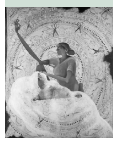
Figure 2: The Embroiderer by ARPANA CAUR (born 1954) [and the women of Mithila] (1996) Oil on Canvas 165 x 137.5 cm

she is ranked within the top ten most well-known painters in India, the Gallery felt it was important to acknowledge the Mithila women who painted the backdrop before including it in the current display.