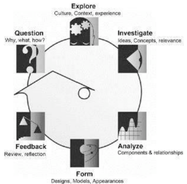
Figure 7: The Inquiry-Learning Cycle in Architectural Education.

investigation: which requires a redefinition of learning objectives at this level.