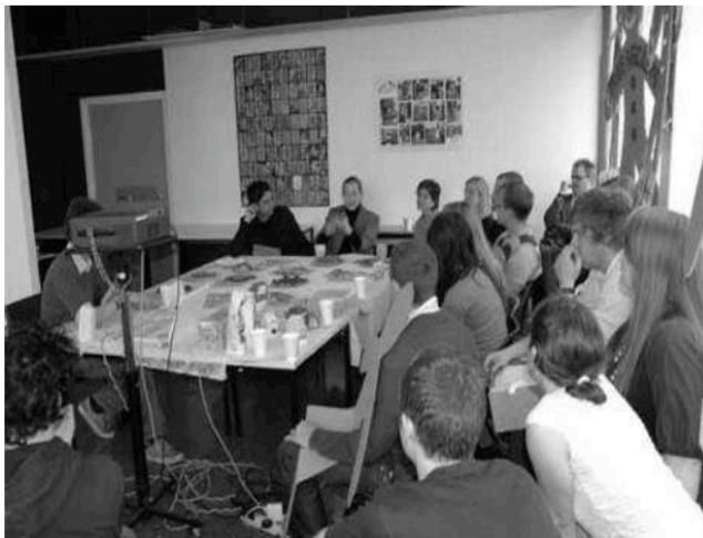
Figure 1: Current teaching setting in the studio: Students listen to tutor's talk on precedents.