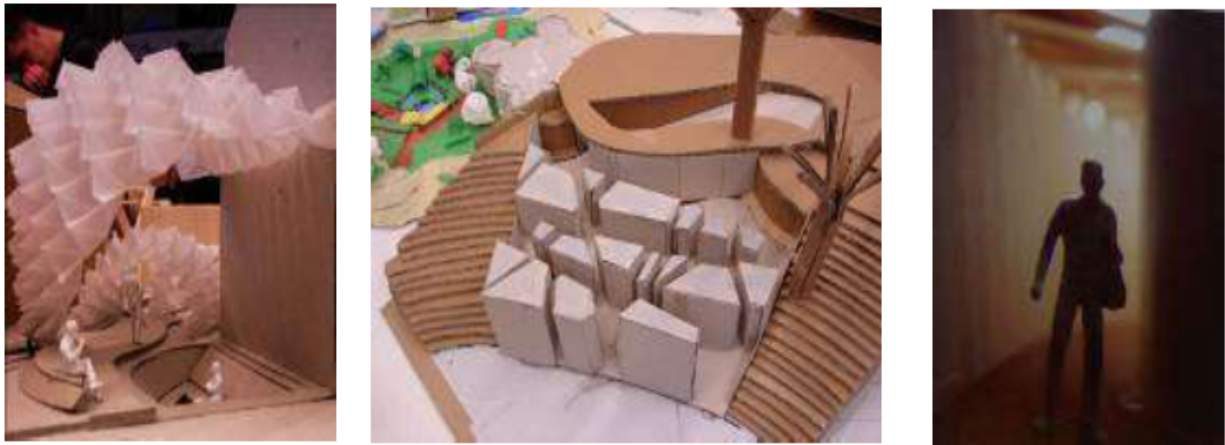
Figure 6: Examples of student' final design outcome representing diverse approaches to contemplation.

On the level of design outcome, students were able to provide a relatively wide range of concepts and developed designs that were in line with the diversity of resources exhibited in their book of ideas. While the design programme and site were similar in several student groups, designs were diverse enough to be categorized under a few principal ideologies or conceptual orientations. Final designs ranged from integration with existing natural context to design of sustainable structures and consciousness of the importance of the material. Most importantly, most design proposals addressed the experiences of the users as a central aspect around which their projects were (Figure 6).