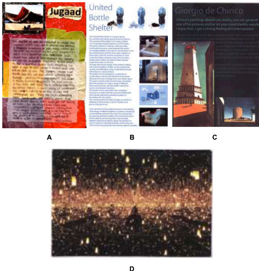
Figure 4: Examples of students' ideas/A4 sheets. A: Outdoor theatre of recycled oil-cans, India. B: Interlocking bottle shelter for humanitarian crisis. C: Paintings of Giorgio de Chirico. D: Infinity room.

platform for the practical implementation of this refined organization. In the first week of the project, every student was asked to prepare a single A4 sheet that displayed, using one piece of visual material and one paragraph, each student's previous experience of being in a shelter or a space of contemplation. Neither examples nor references were given. The essay-paragraph had to communicate why the selected material/space was relevant to the student and how it expressed the process of contemplation. Students were divided into sets of 25 for workshops, within which, groups of five students/groups were assembled. Every student was given one minute to speak about his/her selection and the rationale behind it. Then, groups swapped A4 sheets and analyzed different aspects through which students' materials addressed the notion of contemplation and shelter. At the end, every group presented their analysis of peers' work and the authors were given the chance to challenge/debate these analyses.