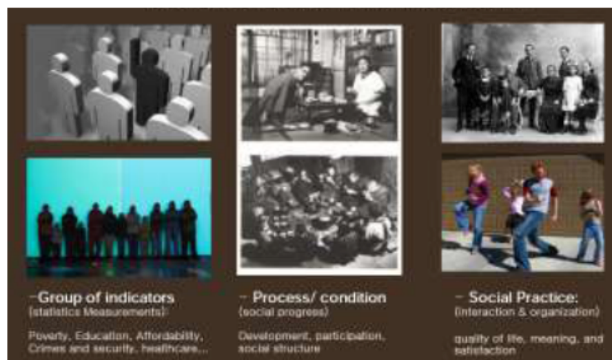
Figure 3: Examples across cultures and history: Extract from the introductory presentation.

Building on students' feedback, the workshop was developed into a set of prolonged activities that promoted students as producers of knowledge. A refined proposal, utilizing enquiry-based learning initiatives, was based on the principle of using real-world problems as a starting point for the acquisition and integration of new knowledge [28]. It denotes students as interactive researchers who channel their personal interests and knowledge into design research. The refined format works as a collaborative production of knowledge that is based on autonomous research activity of each student: who needs to interpret his/her own cultural resources and experiences into a very limited text to present to his/her colleagues. This organization builds on the ' reciprocal teaching ' strategy, which includes explanatory activities, that has dramatically improved the student's comprehension as well as monitoring skills in other fields [30]. These studies suggest that participating in explanatory activities in social situations improves students' learning.