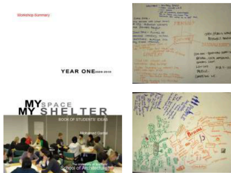
Figure 5: My Space My Shelter, Book of Students' Ideas. Left: Book cover; Right: student's pin-ups.

Tutors were confirmed that students have become more confident, critical and thoughtful about what they propose or draw on paper. Students, on the other hand, were more explicit about how the new format helped them to discover the relevance of design tasks and architecture in general to their personal knowledge and everyday life experience. They were pleased to discover new aspects of the discussed topic that their colleagues addressed and which had not occurred to them. They believed that having similar workshops and student meetings at the beginning of every project would enable students experiencing difficulty in coming up with innovative ideas to learn and develop their own approach without a sense of shame or guilt.