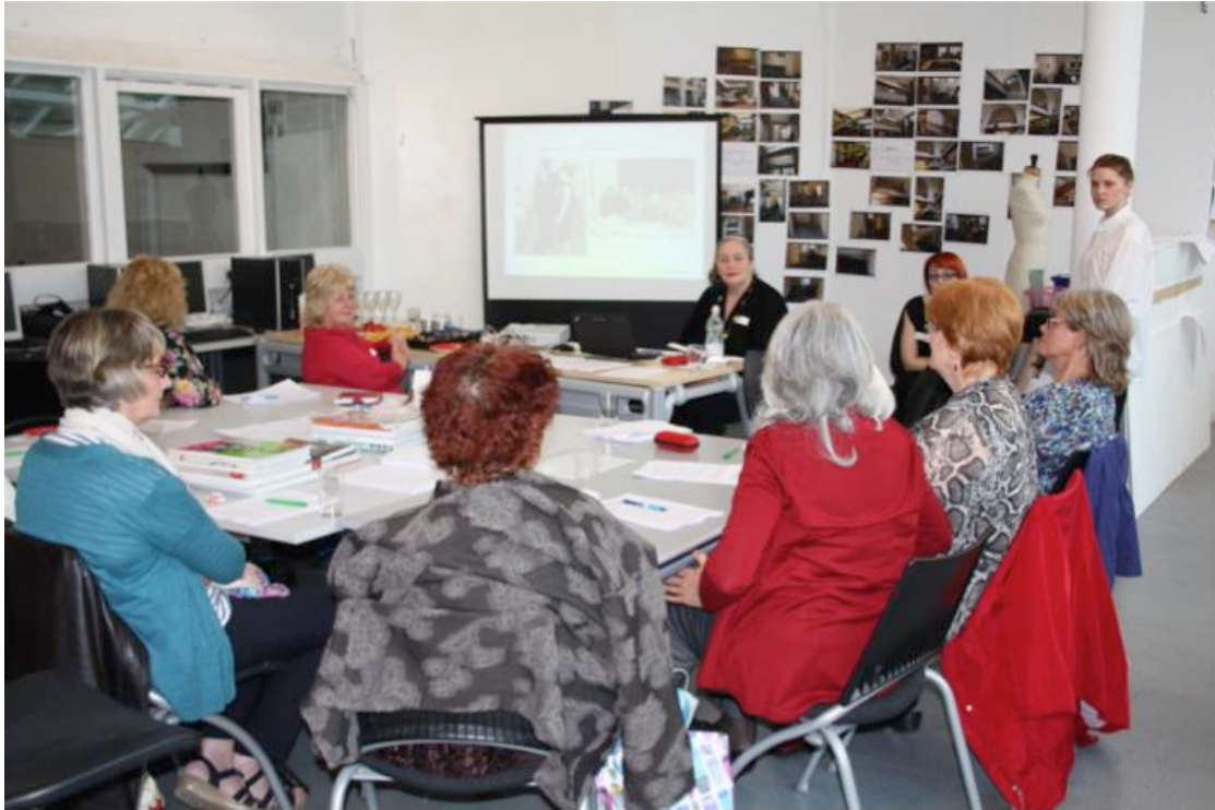
Figure 2: Participants introducing discussing their clothing preferences.

They also related to the skin, and its changing texture, density and decolourization through ageing. The participants also felt that the colours widely available in the shops often did not compliment their appearances; black and white were their classic/ regular choices, however, this was often dictated by the unsuitability of other colours rather than the participants' specific preferences. As indicated by the workshop participants, problems seemed to lie not in the colours per se but in their tonal range. In contrast, all of the women present expressed rather negative attitudes towards colours such as grey or beige through related descriptors of "granny-ish" and "boring". These shades, or 'neutrals' are considered as part of the staple colour palettes for the mature fashion market. Discussion around this issue raised interesting psychological perceptions between ageing and semantics, particularly the notion that once past a certain age women become "invisible" or "neutralised" within Western culture, perpetuated by a feeling that commercial fashion is not designed "for them".