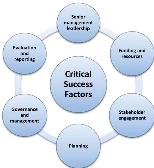
Figure 1. Critical success factors (CSFs) for embedding carbon management.

management are proposed. Figure 1 presents the outcome of the analysis.