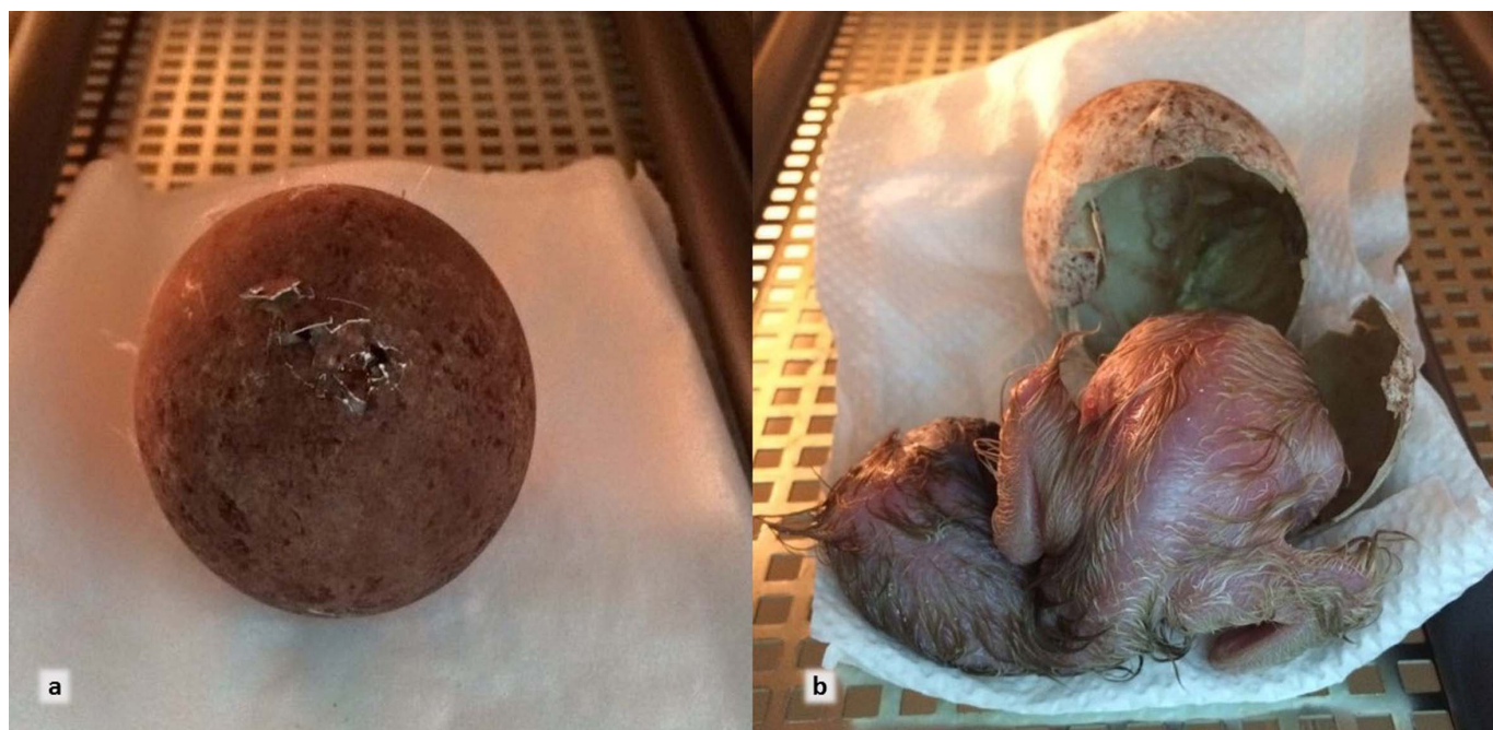
Figure 1. (a) Egyptian Vulture egg in the incubator set up as a hatcher, 80% humidity, 37°C (pipping), (b) Egyptian Vulture just hatched in incubator (set up as a hatcher)

Egg #4 hatched unaided on 3rd April 2016 (43 days after laying; Figure 1a and 1b) and the same process as detailed for egg #3 was followed in terms of housing and husbandry. Due to the lack of similarly aged conspecifics present in the facility at the time of initial intervention, it was not possible to co-house or expose the chick to other Egyptian Vultures, as had been performed for Lappet-faced Vultures described by Mendelssohn & Marder (1984).