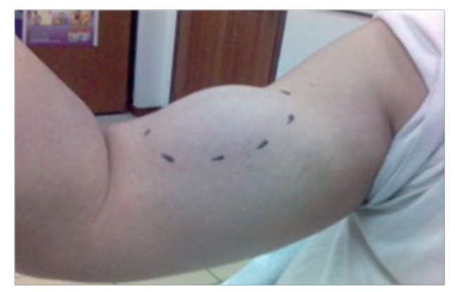
Figure 2 Intra-muscular abscess of the right bicep.39

that 42% of those tested were counterfeit, either containing different steroids to what was declared or none at all.