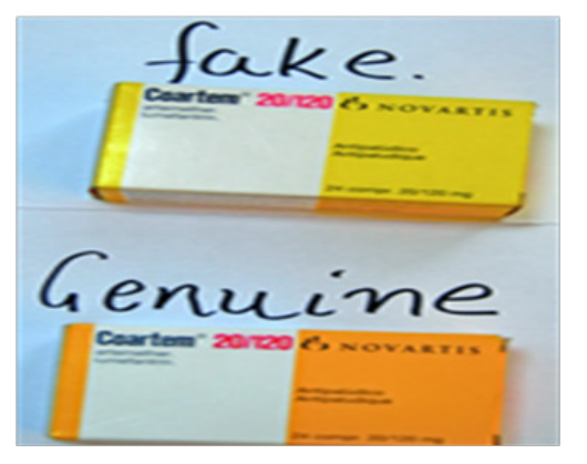
Figure 4 Counterfeit packaging recovered during Operation Zambezi in 2009.^{\mathrm{l2}}