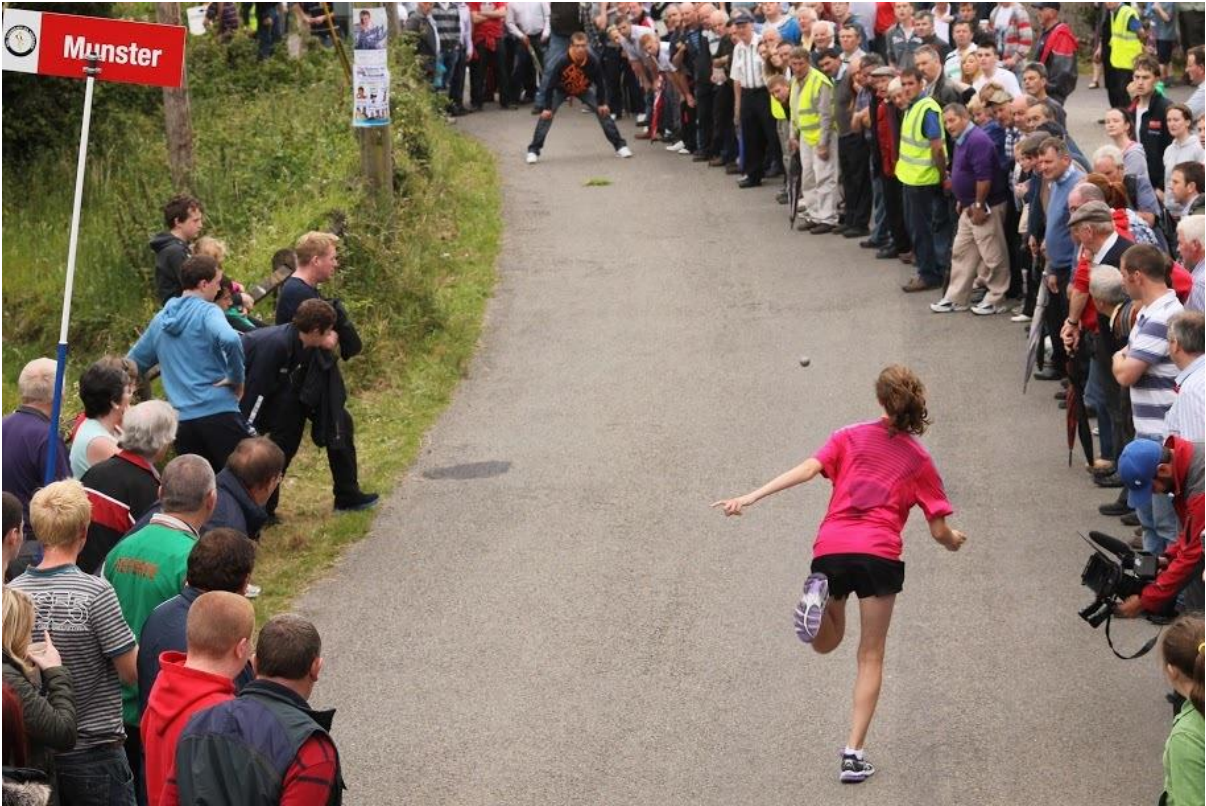
Figure 2: “Man on the sop” – Person who directs which section of the road a road bowler should aim his/her throw with a piece of grass.