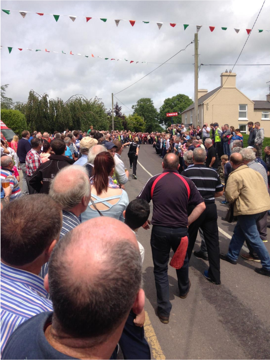
Figure 1: Road bowling, Lyre, County Cork, Ireland July 12 th 2015