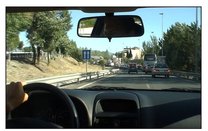
Figure 1: Naturalistic driving study: example view from in-cabin camera