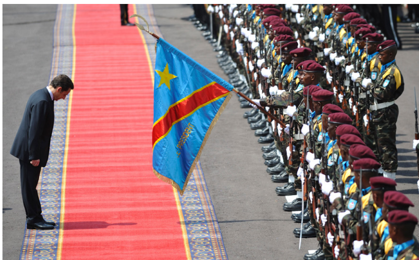
France's President Sarkozy reviews an honour guard in Kinshasa, 26 March 2009

The Democratic Republic of Congo (DRC) is home to risky contradictions: despite being very “rich” in natural resources, it remains consistently “poor” in solid and legitimate state structures. Europe conducts numerous efforts to strengthen Congolese social and economic infrastructures, offering security and governance support alongside more traditional development projects. But its actions suffer from situational ignorance, fragmentation, and policy frailty. A coherent and strategic (international) approach is urgently needed to provide valuable impetus to the most pressing Congolese needs.