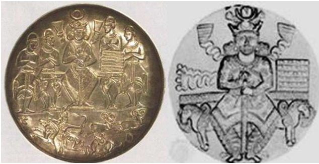
Figure 5. Khosrow I sits on the throne, Walter Museum of Baltimore