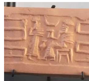
Figure 10. Two Cylinders from Sush, Sikkalmah dynasty, Source: Louvre museum.