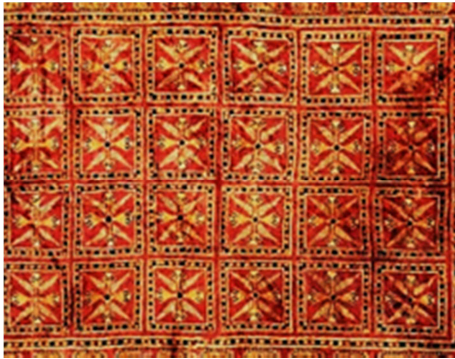
Figure 20. Lotuse flower from Pazirik and a wooden chair.

source of fertility for all phenomena [24].