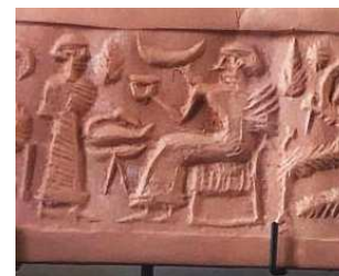
Figure 11. Two Cylinders from Sush, Sikkalmah dynasty, Source: Louvre museum.

The presence of wooden furniture in Iran before and after Islam, like any other countries, depended on the demographic of the individual. The extant examples of art works illustrate the use of wooden-furniture, which seems to be the monopoly of the Royals. It was not until the Qajar and Pahlavi eras that this luxurious element slowly became common in middle and higher-class homes [3]. From this, it is understood that Iranian's homes were commonly covered by rugs, when sitting or sleeping on the floor was a customary habit [20]. Nevertheless, the importance of the