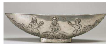
Figure 3. The image of the Sasanian king among the dishes, made in the seventh century A. D., Source: www.raeeka.wordpress.com .