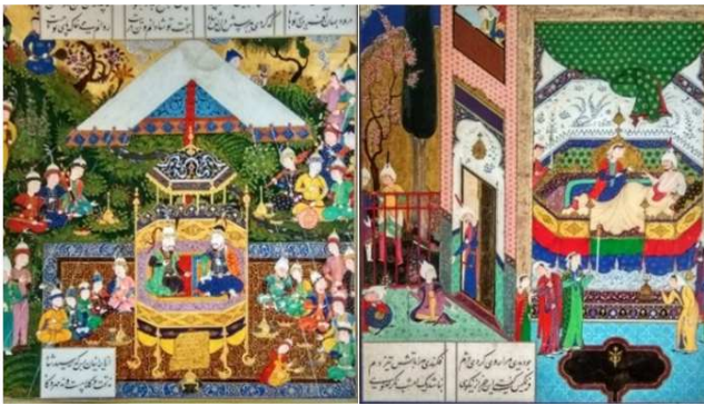
Figure 19. The Shahnama of Shah Tahmasb, Safavid empire, Some examples of wooden furniture in safavid era.

Carpet exports to the European countries that peaked in the Safavid period, continued until the Qajar kingdom too (1909–1925). It was during this period that the elegant Iranian carpet changed with the taste of foreign customers, such as carpets that were copies of French design [17]. Many Great and stunning thrones such as The Marble throne, Sun throne, and Naderi Throne, were made during the time of Fath-Ali Shah Qajar which decorated with fascinating jewels [3]. Later, during Naser al-Din Shah Qajar time (1848-1896) furniture was also given as gifts to the court from trading countries such as India and Europe [21]. Qajar kings and ambassadors who travelled to Europe changed Iranians indoor greatly influenced design taste. These new interior decorations mostly came with the influence of European style, exported high-level furniture [3], and Iranian rugs in a new form of modern and international life style introduced to Iran, which has survived to this day.