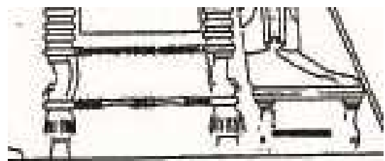
Figure 24. Claws applied on the throne legs.

The lion represents power and fire, it is also a symbol of purity, courage and readiness to sacrifice for its ideal. The role of the lion is repeatedly shown on the carvings of Persepolis. However, in the carvings of the king sitting on his chair, it comes with the design of paws of the lion, which are employed in the lower part of the chair legs (Figure 24). Although this motif may represent many explanations, its relation with the Iranian goddess Anahita may give the king the role of guardian [23].