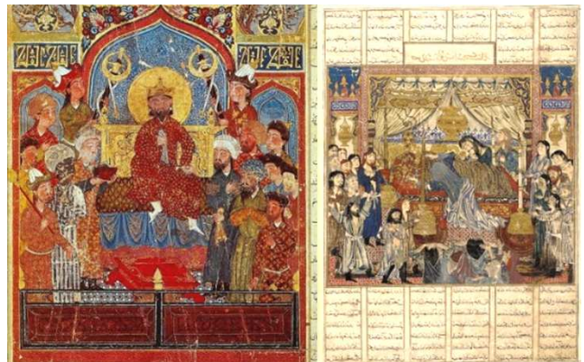
Figure 18. Demotte Shahnameh ( Book of King ), Mourning the dead Iskandar (Alexander the Great) , Freer Gallery of Art and Enthroned ruler , Louvre.

Among ancient references, books of Shahnama like Demotte (around 1330s) provide some forms of high level furniture which used as throne and beds in the court, during the Islamic era of Ilkhanid (Mongols 1256-1335) and the Timurid empire (1370-1506). Rugs can be observed in most of Demotte's illustrations, which reflect the kings' interest in carpet (Figure 18).