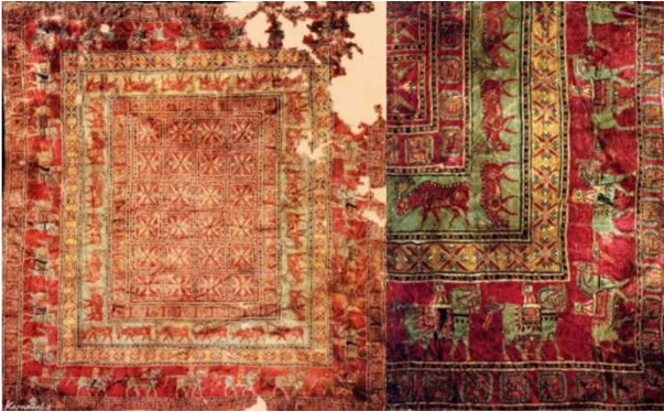
Figure 1. Pazyryk, Attributed to Achaemenid.

from the time of Qur'anic Creation to 915. However, in addition to these carpets, high status furniture can be seen illustrated on carvings and artwork decorations, such as Sassanid metal works. This form of visual reference is the only surviving source available to scholars and this study.