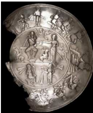
Figure 7. The throne of the Sasanian shrine is protected by legendary creatures.