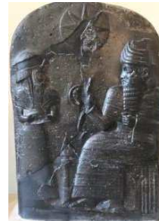
Figure 9. Babylonian stele, Shown an Elamite king sitting on stool form furniture, 1184 to 1155 BC, Source: Louvre museum.