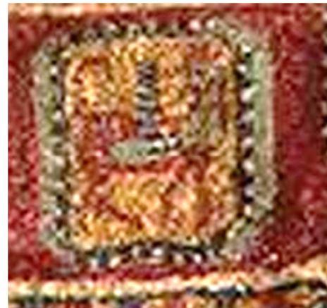
Figure 23. Giriffin motif.

extraordinary and vigilant symbol in Iran's mythological culture. Acheamenid emphasized the griffin's strength in guarding and protecting against evil [4]. The griffin in the Pazyryk rug design is placed inside a square to emphasis the animal's peaceful character (Figure 1). The square is a symbol of stability, calmness and represents the quadrangularity of the world. It can further symbolize the protection and care of a ritual parade, which is often depicted in Pazyryk rugs, located on the outer edge of the carpet.