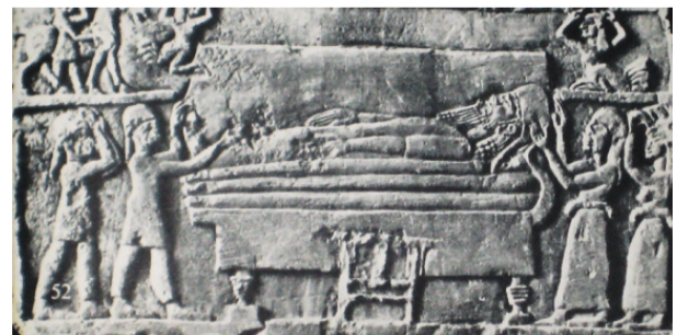
Figure 15. Achaemenid carving found in Egypt, Source: www.utop.news/hashtag/acamenid_empte .

The role of women in the Achaemenid period evolved. In comparison with previous kingdoms, their duties were limited. However, women were able to find a way to retain their political and cultural influence. For instance, most of the marriages at that time were political [22]. In terms of design features figure 12 shows the differences between the design structures of the chairs used by the king in figures 13 to 15; the female figure is seated on a smaller chair with a lower backrest than the king's chair. Although, figure 12 shows more decorations which could reflect the taste and tact of the designer in showing the social position and gender of the user. Mentioning that this was not just in Iran, comparing with China, for instance, designed chairs for women also presents detailed decoration for this period (Figure 16).