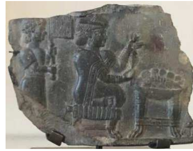
Figure 8. Lady spinning and her maid, Elamite time, Shush area, Iran.

The presence of different forms of seats from a simple, small structure such as stools to chairs and thrones come from the surviving evidence from 4,000 B. C. in Iran. The very first images of furniture made in ancient Iran's boarder during the Elamite era are shown on many cylindrical seals in the form of stools and simple chairs with backrest (Figures 7~8), which represents the idea of this furniture type being used by high status figures [3].