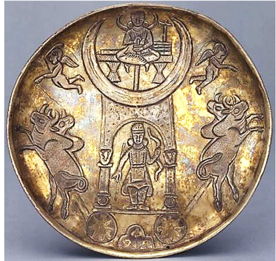
Figure 17. What is engraved on this plate is consistent with the Roman soldiers' report of the Taghdis throne.

The Sassanians (224-651 A. D.) saw themselves as the inheritors of the Achaemenid (550-330 B. C.). So that, the culture of the king's throne with its animal elements (Figures 3, 5, 7) was continued by Sassanid emperors. Ansari in his book Deco (2012) describes the throne of Sassanid king as gold, and silver made seats for courtiers [3]. While Vaziry [20] pointing out Sassanid kings embroidered on the royal throne are engraved on silverware [20]. The most well-known, large, and high-level throne attributed to Khosrow Parviz II which was called the "Taghdis throne" (590 A. D.). There are four rugs explained to decorate the Taghdis throne that were molded with pearls and rubies illustrated the four seasons [26]. In this period, just like Achaemenid, there are no surviving examples of rugs. However, woven carpet in Chinese documents are mentioned as a commodity imported into China during this era [25].