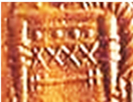
Figure 21. Lotuse flower from Pazirik and a wooden chair.