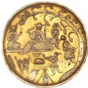
Figure 6. Plate with musician figures.