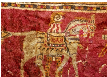
Figure 22. Horse motif. Griffin (Shirdal in fari).