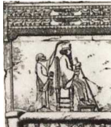
Figure 14. Persepolis carving, Iran, Source: www.fa.wikipedia.org/wiki/ .