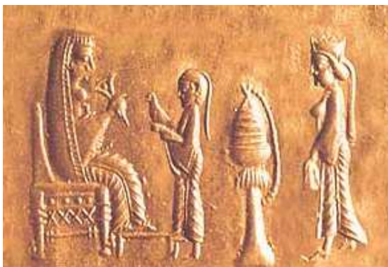
Figure 12. An elite woman is sitting on a high-level chair with her legs on a stool and holding a lotus flower. Her dress is Achaemenes's garment with a crown form and a veil on it.

When the powerful kingdom of Achaemenian came to power (circa. 550-330 B. C.), their art was biased on the status of the Kings. To present this by combining the art of the various Achaemenid tribes [16] they promoted their art, which resulted in an abstract, symbolic form of plants and animals. However, at this time, the arts of the neighboring countries were mostly associated with the world of the dead [1]. Achaemenid art kept its vibrant and lively style, and freeform initiative. Observing the figures sitting on the illustrated chairs, and considering the types of clothing, hair arrangement, and their surroundings, the high social status of this furniture among the high-ranked Achaemenid can be recognized. These seated figures are mostly depicting the ceremonies and royal visits in the capital (Figure 13) [3]. For instance, the woman in figure 12 may be a princess or a queen, or Achaemenid Kings presented in figures 13 to 15 are centered figures that show advanced high-level furniture of its time. What is significant is the use of short stools along with illustrated chairs on the carvings. By looking more closely at these images the extended front legs of the chairs are noteworthy as they were designed to raise the occupant's position, which requires the presence of the stool. In other words, the seat height of the throne is higher than the seat height of a domestic chair elevating the occupant to show importance.