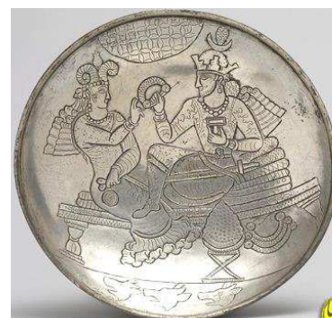
Figure 4. Image of the Shah and the Sasanian princess at the Art of Walters Museum, Period: Sassanids from the 6th and 7th centuries AD, The presence of the horn of the ram on the king's throne, Source: en.wikipedia.org/wiki/Sasanian_art .