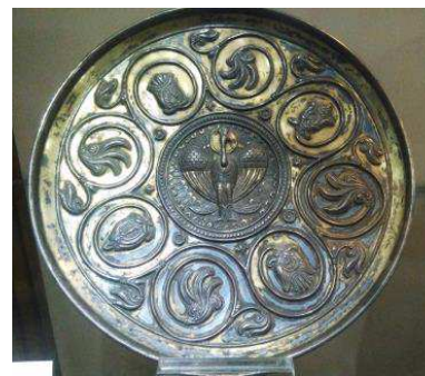
Figure 2. Sasanian Metalworking with the peacock design, Source: https://iranatlas.info/sassanid/sassanid-art.htm .

With our perception of modern furniture, it is difficult to recognize these early forms as wooden furniture, since the surviving evidence represented on the Achaemenian wall carvings and Sassanid metal works presents them as quite different to contemporary types (see figures 2~7). The study of these depictions of modern furniture provides evidence of the social status of the user. The forms, structure and decorative elements represented support the notion that high-level (modern) furniture was common among society elites and high-ranked authorities.