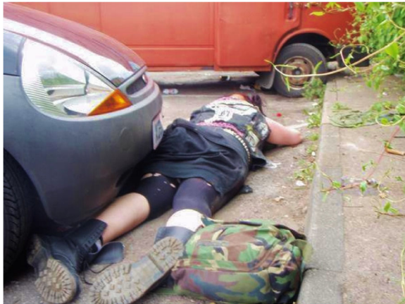
Fig. 2 At rest

selves and describe how self-harm can be protective in that it allows the internal self to remain hidden, whilst offering a sense of mastery (being in control of the perception of others).