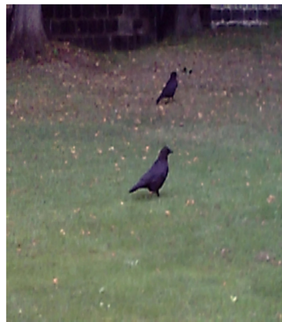
Fig. 1 The birds

Both males in this study, participants 3 and 8, talked about their experiences in a very visual way. Participant 3 in particular presented pictures to represent the contents of his flashbacks; four out of five images represented traumatic experience which he found difficult to verbalise. One of the images captured two birds, see Fig. 1. He discussed how he wanted to capture an image of a heron; he described a fear of herons and how the sight of one would trigger an act of self-harm. He