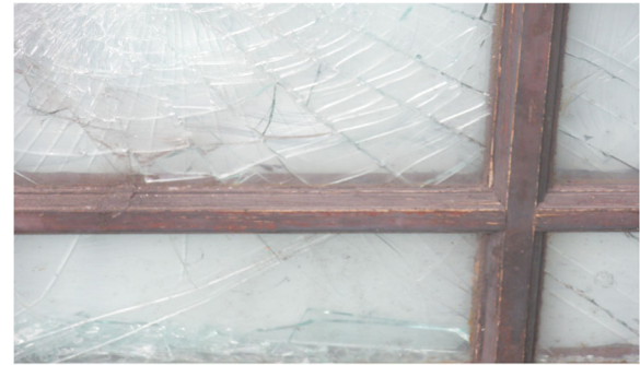
Fig. 3 Broken glass

The theme of self-harm as a sense of mastery captures how feelings of control (or a lack thereof) were