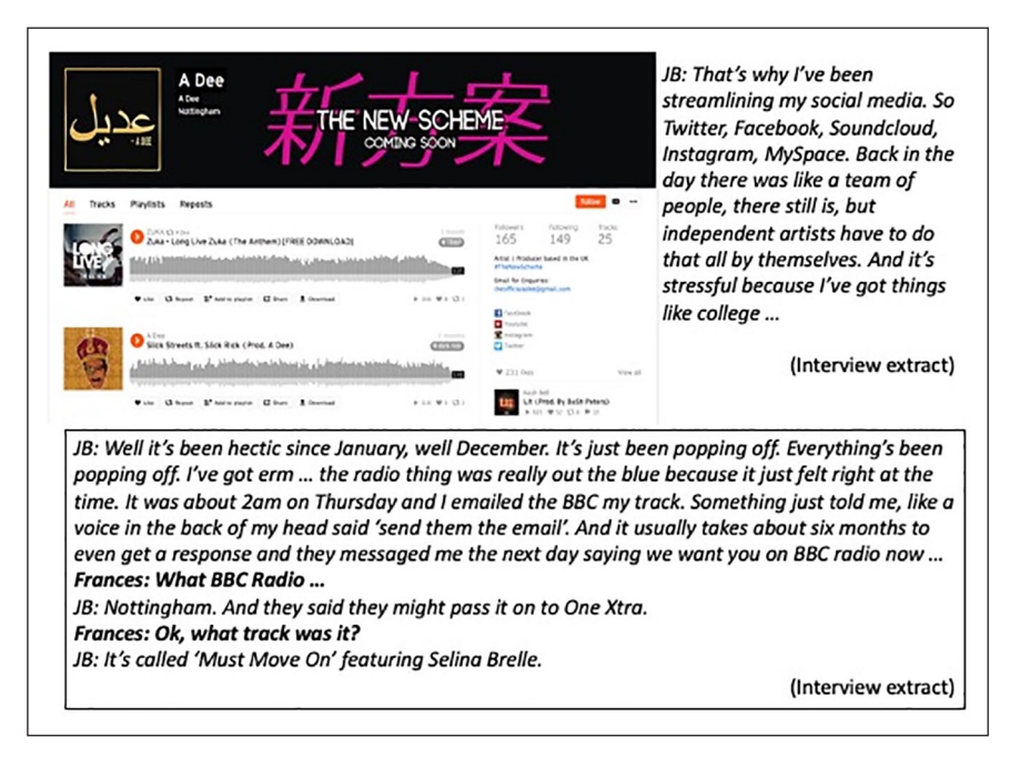
Figure 4. Trying to make it 'big' – self-promotion. Vignette of Soundcloud page screenshot with two interview extracts.

Whilst entrepreneurial and subcultural capitals combine to offer common cultural dispositions, these did not advance the position of all creative agents within the field. My data demonstrate that the range of capitals and dispositions continue to be stratified. Although both types of capitals are aligned to the Cultural Industries and represent opportunities for young people to become artistic producers, for those whose subcultural capital aligned with perceived deviant behaviours, this led to reproduction of social status. As these ethnographic data highlight, young people developed the capitals and dispositions, not aligned to the 'high arts' but to the Cultural Industries. However, for working-class young people who came with low cultural capital, the Arts Award programme served to reinforce their sense of and objective position within the lower levels of the social hierarchy.