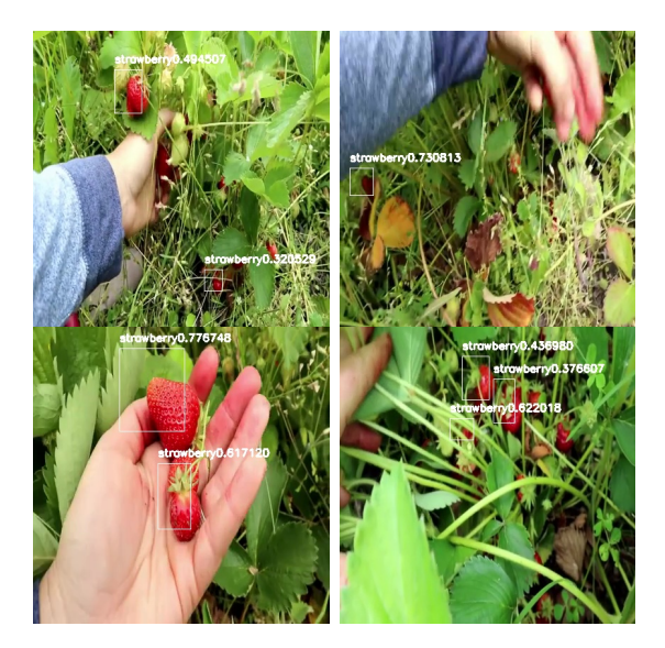
Fig. 5. Classification of strawberries over four image frames extracted from a video footage

can accurately detect strawberries in ideal positions. The key takes away is to include more data, especially images that contain strawberries in clusters. As such, it is expected that problems will arise when testing the algorithm in different settings—another foreseeable issue adapting the algorithm to detect strawberries in clusters. More research and testing would need to be conducted to find a potential solution.