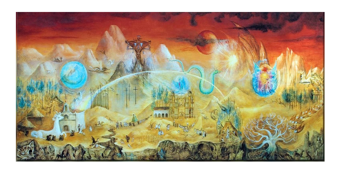
Figure 3.1 El Mundo Magico de Los Mayas (1963), Leonora Carrington © Estate of Leonora Carrington/ARS, NY and DACS, London 2023

this way Carrington forges a painting cut adrift from European bias, turning towards images and philosophies that chime with Mexico's indigenous ancestry, but which also anticipate a posthuman approach. It is a syncretic work: one that not only melds Mexican's rich ancestral cultures together but also merges with Carrington's own visionary symbols where magical and mystical animals – seen in her earlier work in Europe - blend with Mexico's own iconographies.