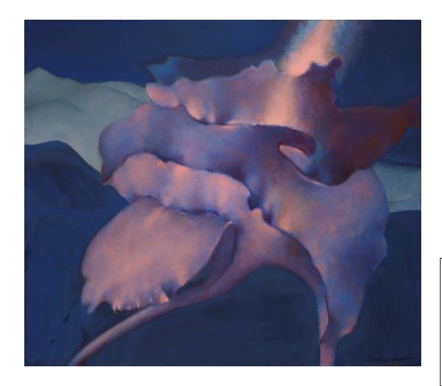
Figure 2.4 Crepuscula glacialis (var., Flos cuculi) (1997), Dorothea Tanning © ADAGP, Paris and DACS, London 2023

The final paintings I examine in this chapter, Woman Artist , Nude, Standing (1985-87) and Crepuscula glacialis ( var., Flos cuculi ) (1997) can be read in tandem with On Avalon with their shared themes of anonymous identities exhibiting a palpable materiality. Like the figures of the larger, earlier painting, the female in Woman Artist is naked, her nudity indicative of a raw elemental force rather than symbolising eroticism and vulnerability in the manner of the male surrealists' femme-enfant depictions. A visual evocation of Tanning's description of woman as 'fire at the earth's center' in the earthly ochres of her palette, her loose brush strokes create the sense of colours spilling over from the female form and thus bleeding into the landscape.<sup>51</sup> Her metamorphic work forges a materialist locale in the suggestion of inner and outer spaces collapsing, thereby dissolving humanist dichotomies which insist upon the separation of the human from the natural world. The female figure's head, face and eyes in Woman Artist , are obscured by a shadowy mantilla hat where Tanning typically foregrounds the subject's anonymity and usurps humanist