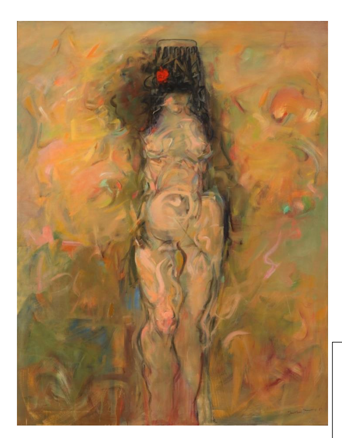
Figure 2.3 Woman Artist, Nude, Standing (1985-87), Dorothea Tanning

the white flowers and human figures not as discrete, autonomous forces but agents implicated in a wider, entangled materiality; the dark background an affirmative portal that speaks to the agentive unpredictability of a material landscape that dethrones Cartesian presumptions about human's hierarchical control over all nature and matter. In this way Tanning conjures trans-corporeal contact zones where matter collides and intra-acts in unpredictable ways; where her work speaks to Bennett's vibrant matter, which conveys the 'sense of a strange and incomplete commonality with the out-side'. <sup>49</sup> She simulates a vital materialist approach that anticipates Bennett's calls to 'treat non-humans – animals, plants, earth, even artifacts and commodities – more carefully, more strategically, more ecologically' in an implicitly feminist manoeuvre. <sup>50</sup>