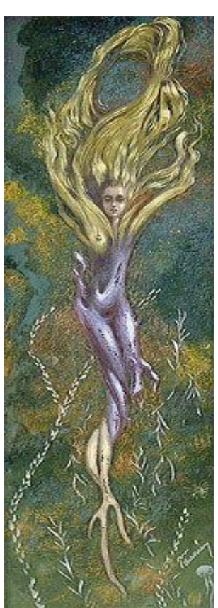
Figure 2.1 Daphne (1943), Dorothea Tanning © ADAGP, Paris and

Barad's intra-active praxis where an already agentive entity catalyses another in the ongoing process of their intrinsic entanglement. I posit that Tanning's surrealist visions of the natural world, which assert a kinship between botanic life and female corporealities, embody Alaimo's suggestion that 'Feminist theories, politics, and fictions [...] can "play nature" with a vengeance by deploying discourses of woman and nature in order to subvert them'. In doing so, Alaimo argues that such discourses and visions, 'can destabilize the nature/culture divide while constructing feminist alliances with postmodern natures'<sup>35</sup> – a praxis that I argue Tanning deploys in her surrealist landscapes. In the following analysis, I examine Tanning's early painting Daphne (1943), arguing that it exhibits trans-corporeal motifs and 'intra-active' entanglements which speak to a new materialist feminism.