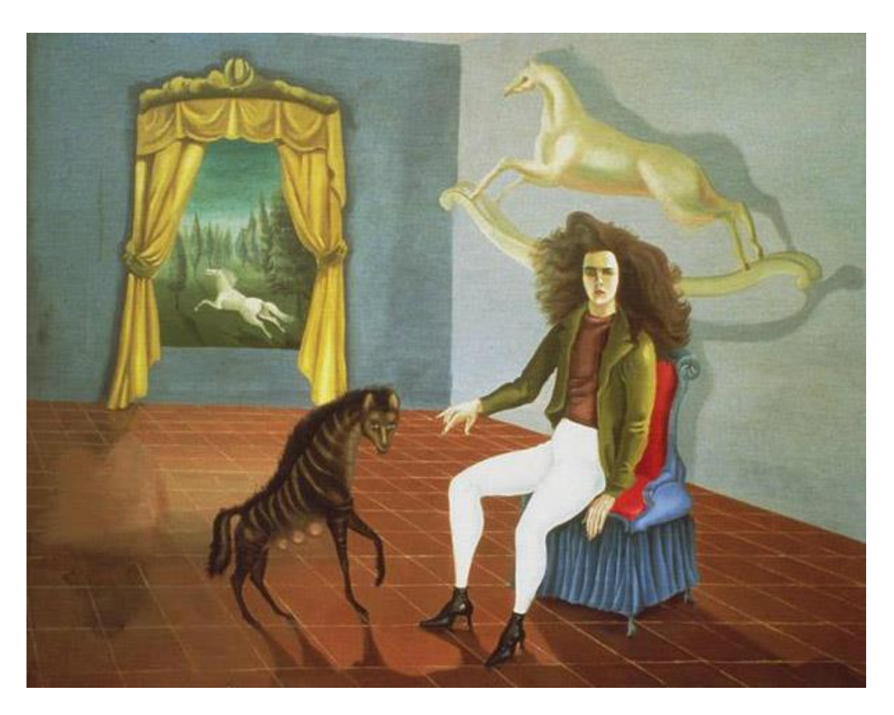
Figure 1.1 Self-Portrait (Inn of the Dawn Horse) (1937-38), Leonora Carrington © Estate of Leonora Carrington/ARS, NY and DACS, London 2023

Carrington painted her Self-Portrait during the same period in which she wrote 'The Debutante' and whilst it is not a violent confrontation in quite the manner of the short story, Carrington's portrait is the narrative's visual complement. Here we witness how Carrington harnesses, in Chadwick's words, the 'instinctual life' in the figure of the hyena and the horse of the painting which appears as both a wild version outside the window and a toy rocker inside. The hyena lactates in a manner that mirrors the woman of the painting's own sexual awakening and in this way also recalls Chadwick's assertion that she represents the 'fertile world of the night'. Whilst not directly presented as hybrids, there is a sense that the human's and animal's ontologies collide in the mirroring of their bodies via