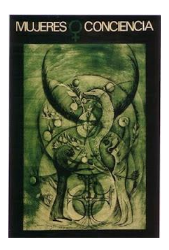
Figure 3.2 Mujeres Conciencia [ Women's Awareness ] (1972), Leonora Carrington © Estate of Leonora Carrington/ARS, NY and DACS, London 2023

surrealist circles to forge art and writing that chimed with the post-Eurocentric principles of Latin America.<sup>41</sup>