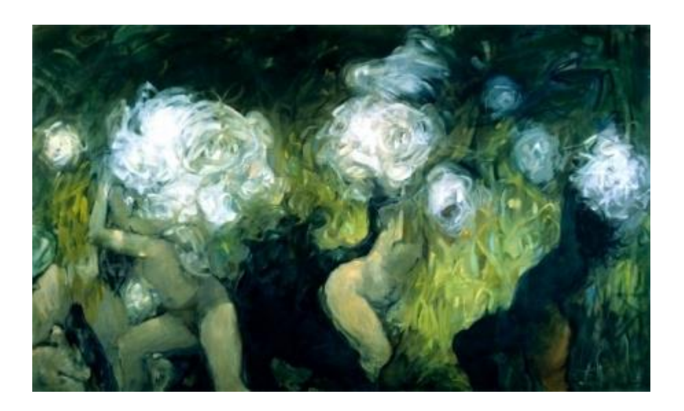
Figure 2.2 On Avalon (1987), Dorothea Tanning © ADAGP, Paris and DACS, London 2023

Daphne's hair is depicted as a force which is 'uncontrollable and uncontained' in the way that Carruthers describes, surging on whilst intra-acting with the natural currents with which it co-mingles. It is also presented as something desirable and beautiful, recalling Rapunzel's locks thrown down from the tower in which she is imprisoned. There is the sense, however, that Daphne is not trapped, like Rapunzel, but is in fact liberated by this agentive landscape which brims with lively matter. She is not a figure planning to meet a prince as Rapunzel does, but one who finds resonance in her trans-corporeal communion with the natural world; a material landscape that erases the nature/culture binary which Humanism insists upon. In this vision Daphne is not passive prey to be consumed by Apollo, but dynamic intra-active matter who takes a trans-corporeal, material fusion with her environment as her cue; a vision that I suggest Tanning develops further in her later, more abstract painting, On Avalon (1987).