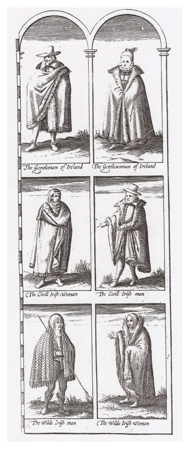
Figure 1. 'Wilde Irish', from John Speed, The Theatre of the Empire of Great Britain (London: John Sudbury & George Humble, 1611), between 137 and 138.