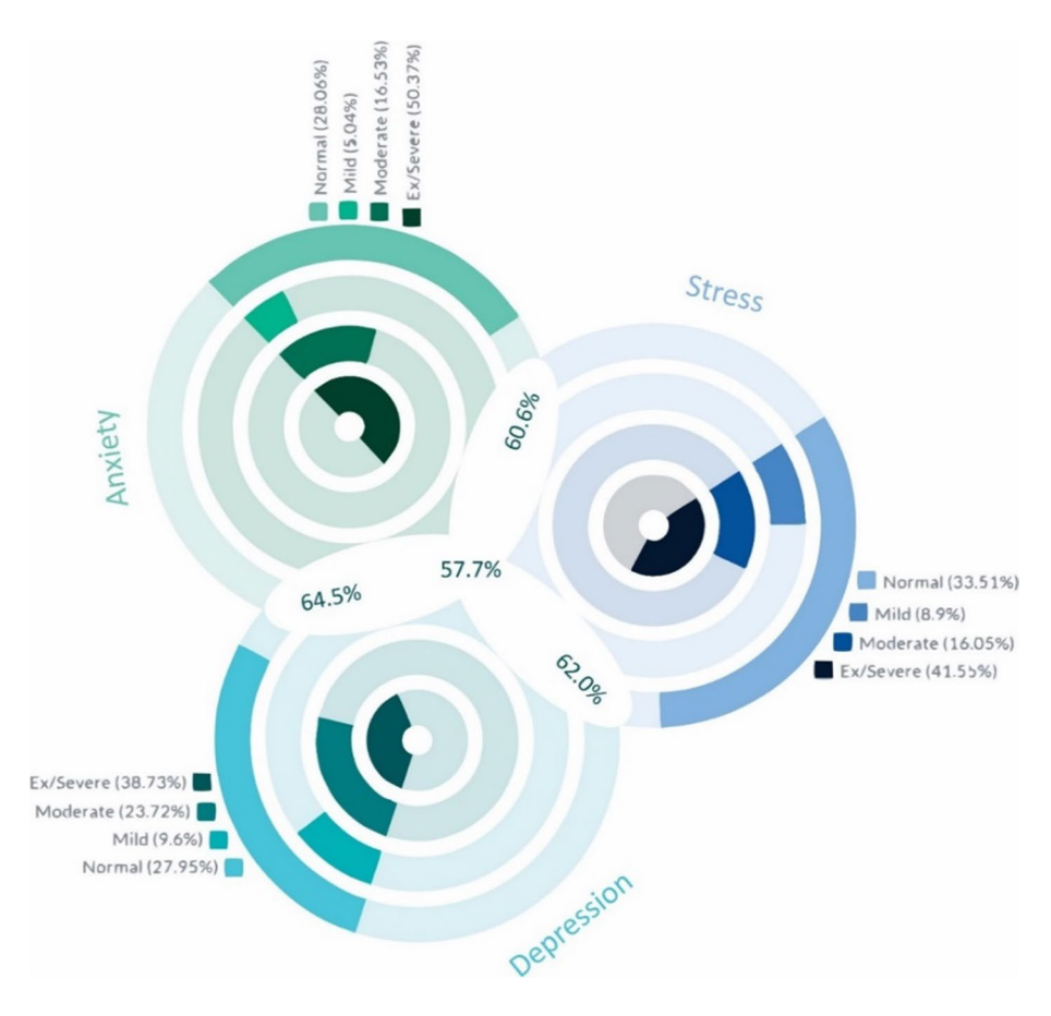
Fig. 2 Categories of depression, anxiety, and stress (Afghanistan-2023)

The emboldened numbers simply emphasize the significant results