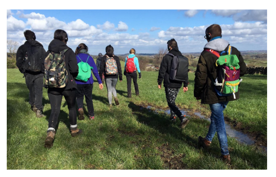
Figure 1. Participants during Pentrich Rising -South Wingfield.

The author's approach is concerned with listening, but also experiencing place through the full range of senses and critical faculties. Each soundwalk invites participants to engage with both granular and panoramic features of the land and soundscape. As the author leads a group along the route, and in maintaining synchrony between soundtrack and landmarks, his pace and consequently that of participants can veer between rapidity or slowness, or even