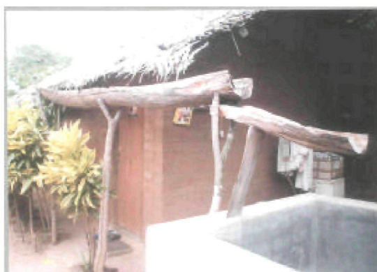
Fig. 3: A coconut frond thatched roof where rainwater is collected in a tank using indigenous wooden gutters