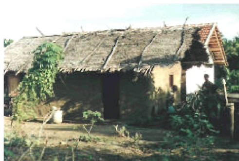
Fig. 1: A coconut frond thatched roof

This tank was designed for the dry areas of Sri Lanka where any of the water supply schemes still have not effectively met even the basic water requirement. Often very poor people live in such places and mere availability of water would make a significant change in their lives as it would help not only their domestic water requirement including drinking, but also the requirements of any small scale irrigation. The visits to these areas show that the type of water these people often are compelled to drink are of very low quality and often the harvested rainwater would be of better quality even if drunk without boiling. Figs. 1 and 3 show typical coconut frond thatched houses of the rural poor and Fig. 2 shows raw coconut leaves being woven.