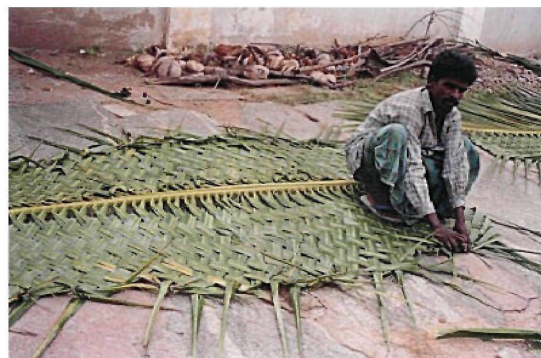
Fig. 2: Weaving a coconut frond