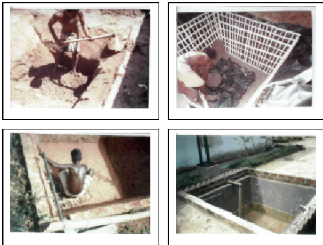
Fig. 7: Some Photographs showing various stages of construction of the tank.