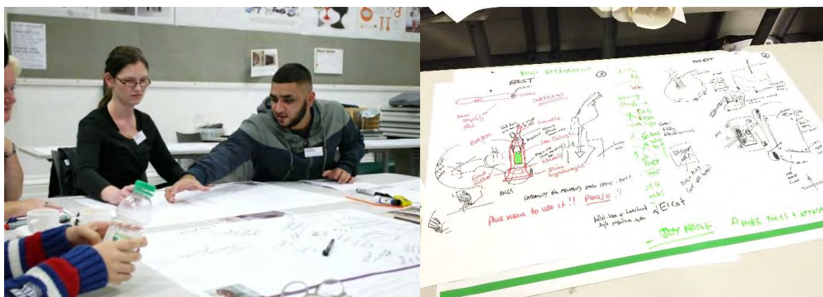
Figure 1. Workshop participants discussing and sketching the most frustrating and most enjoyable vacuum cleaners (left). The resulting sketches (right).

The proportion of 'top' rankings by the survey respondents were as follows: vacuum cleaners that were maintenance free (59%); machines that communicate their performance (23%); a rewarding experience (9%); looking good as it gets older (6%); resale value on replacement (3%). These preferences were confirmed by and explored with the focus group, identifying real time performance information as specifically appealing.