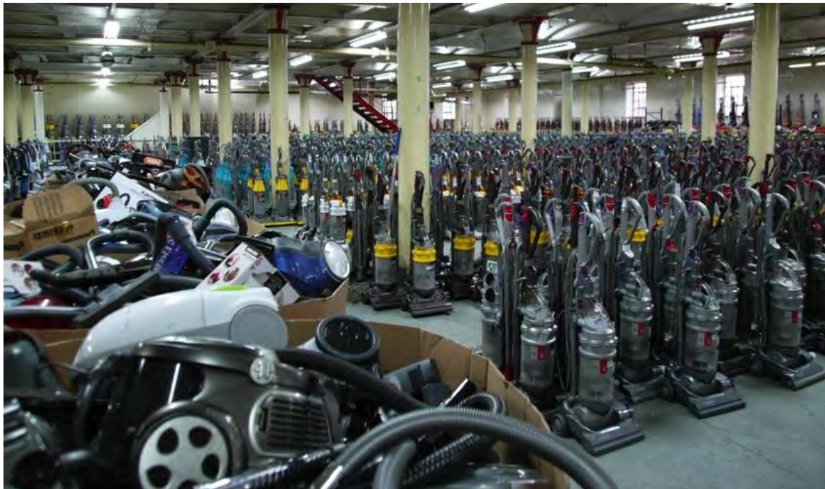
Figure 3. A selection of traded in vacuums at an auction house, the majority according to the vendor in good working order.

machines that are still operational or with which owners have a degree of product attachment.