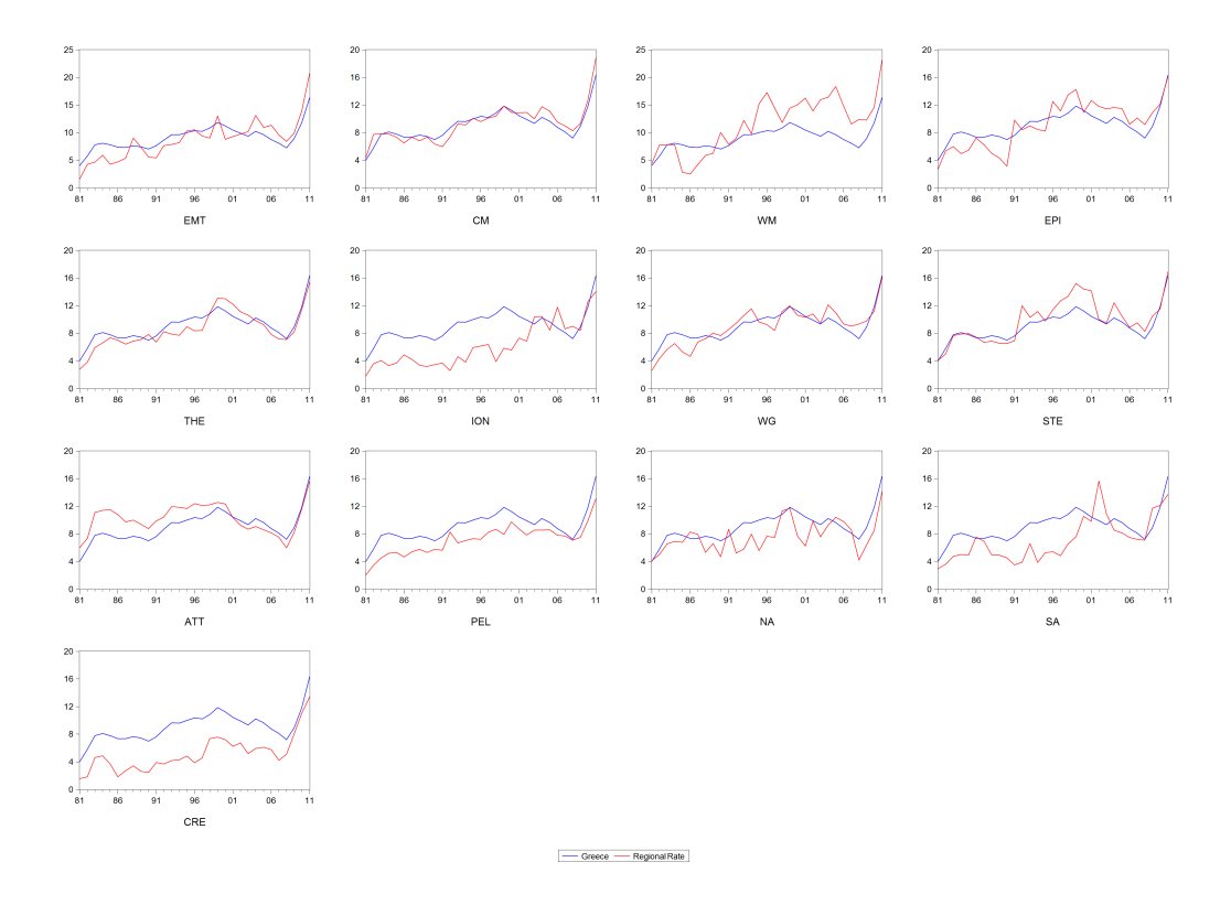
Figure 2: Annual Regional and National Unemployment Rate, 1981 – 2011.

Notes : * indicates rejection of the null hypothesis at 5% significance level, the 5% critical value for the panel unit root test is -1.645.