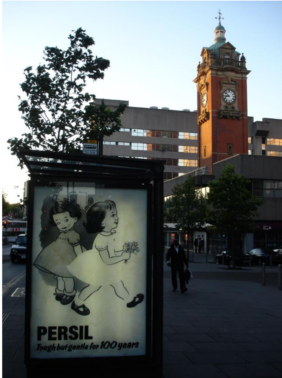
Figure 10.2. The Clock Tower of the former Nottingham Victoria Station ghosting today's shopping mall. (May 29, 2009)