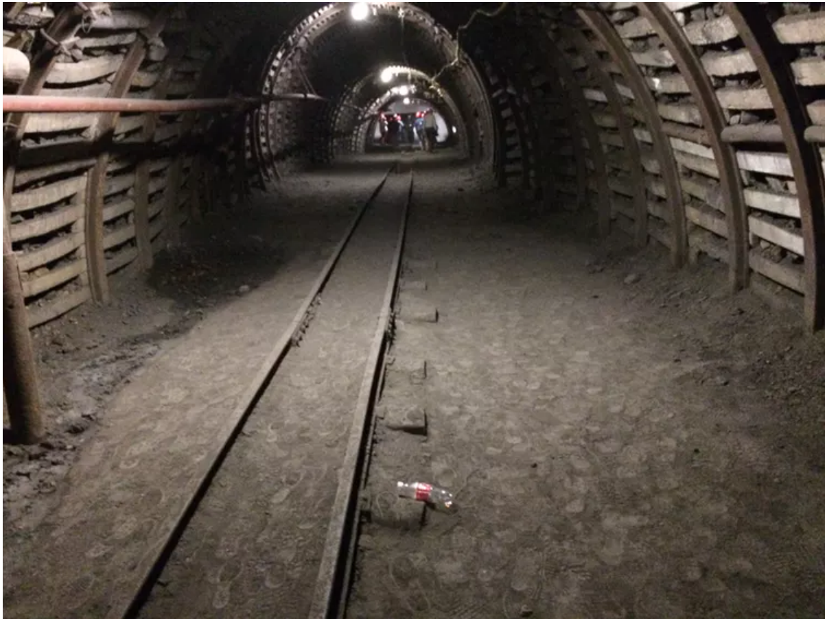
A coalmine gallery: if the water pumping stops, this gallery will be gradually flooded.

But what happens inside the coalmines after their closure? Surprisingly, most disused coalmines start producing methane – known as Coal Mine Methane (CMM) – which can be a clean source of energy. It can be used to generate electricity via gas engines or, with some technical processing, be fed into the gas grid. Over time, however, the mines will begin to fill with water and the methane will almost entirely disappear.