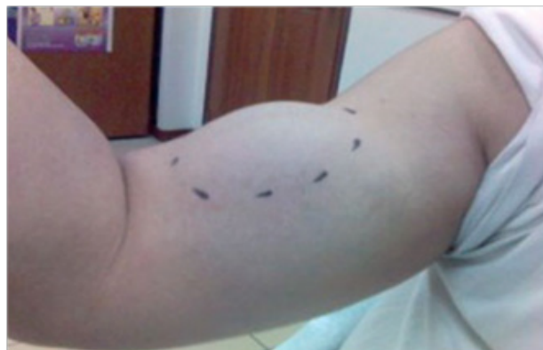
Figure 2 Intra-muscular abscess of the right bicep. 39

that 42% of those tested were counterfeit, either containing different steroids to what was declared or none at all.