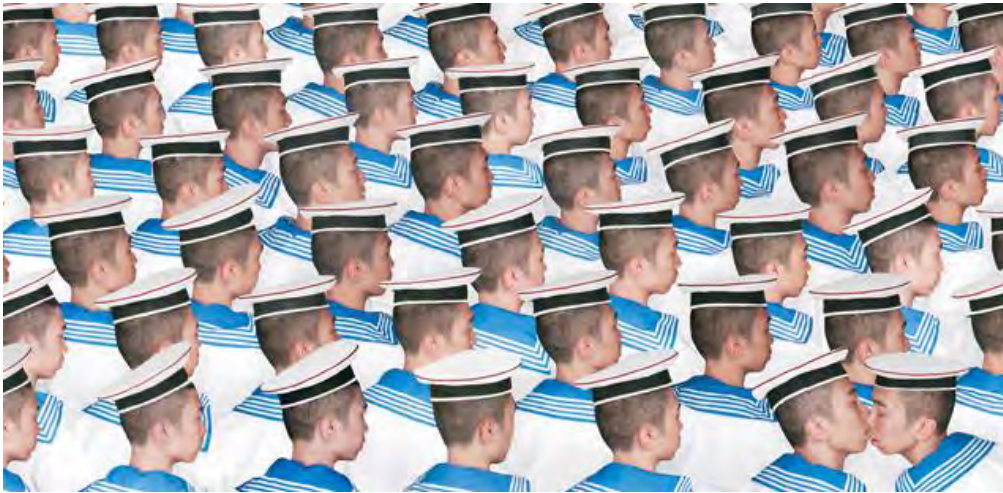
Figure 5. Work of Wang-Zi (VärldskulturMuseerna: https://bit.ly/2rick3d ).