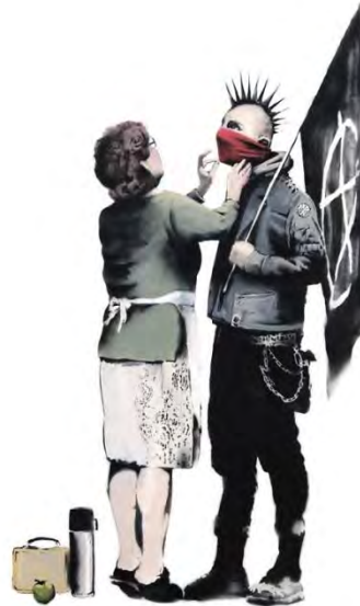
Figure 4. Banksy. Artist's website ( www.banksy.co.uk ).

Activism is a current language of independence and freedom. In our research activities, we have recorded hundreds of activism experiences around the globe. We will now highlight some essential prototypes from our archive to study their cases. A clear example is Banksy, graffiti artist, political activist and unidentified film director, who carries out his work from Bristol in the United Kingdom anonymously. The artist defines graffiti as the revenge of the lower class or guerrilla that allows an individual to wrestle power, territory, and glory, in front of a larger and better-equipped enemy. Banksy's works have addressed various political and social issues, including anti-war, anti-consumerism, and anti-fascism.