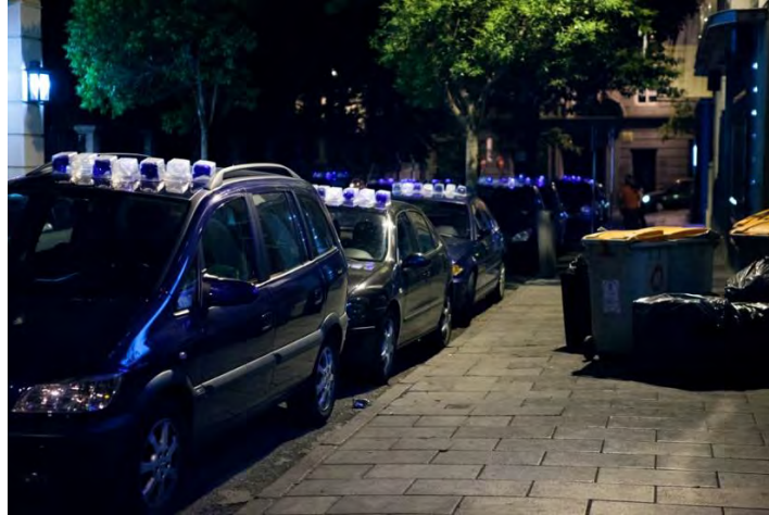
Figure 7. Luzinterruptus ( https://bit.ly/1w4GZPw ).

of what is popularly known as the muzzle law, referring to the Organic Law of Protection of Citizen Security, approved by the Popular Party in July 2015.