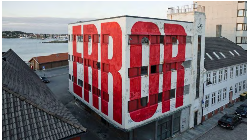
Figure 1. From the Madrid-born Artist SpY, Painting in Stavanger (Norway) ( http://spy-urbanart.com ).

The language of activism is multiple and generative; it does not respect fixed cultural rules. As Abarca points out (2016: 5), “thanks to the unregulated nature of their practice, urban artists can ignore the limits dictated by private property that determine where they can or cannot act. A work of urban art can simultaneously cover two or more contiguous surfaces belonging to different owners, thus ignoring the division of matter and space demarcated by money. Urban art can, therefore, make visible how these limits of action and physical boundaries are arbitrary and cultural. It can return space and matter to its natural state when everything was for everyone's use, and nobody owned anything”.