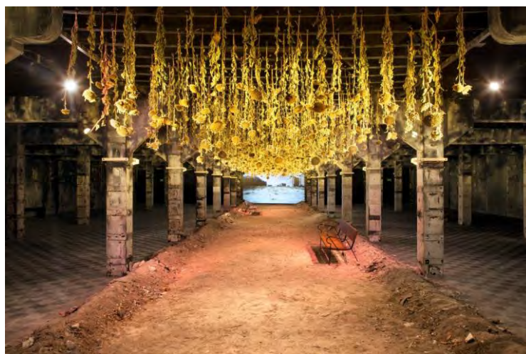
Figure 8. Basurama ( https://bit.ly/2JXExDt ).

A similar Spanish example is that of the collective Basurama, founded in 2001, which is an example of activist creativity that has centered its area of study and action on production processes and the generation of waste involved. The “Agostamiento Project” was a site-specific contribution to the “Abierto x Obras program” that took place in the old cold storage room of the Slaughterhouse in Madrid. The collective proposed an interior landscape created by planting 7,000 sunflowers that had been cultivated next to the inhabitants of the “Gran Vía del Sureste”, in the “Ensanche de Vallecas”, an iconic neighborhood of the real estate bubble. Their creation, in the words of Basurama, “is an invitation to chat and eat sunflower seeds, looking to the future from the darkest place”. This project was made in Madrid in 2016.