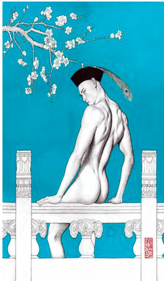
Figure 6. "Calendar" Work of the Chinese artist Musk Ming ( www.muskming.com ).

In Spain, the economic crisis of recent years has become a true incubator for activism. Luzinterruptus, a collaborative and anonymous group created in 2008 and working in large cities such as Madrid and Berlin, is characterized by interventions in the public space using light as raw material. In 2014, they carried out their protest action in Madrid "The Police Is Present", in rejection