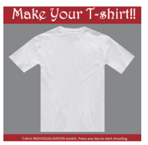
Figure 1. Screenshot of the toolkit

To start the exercise, each participant had to roll two dice to find out how many paint marks his or her t-shirt would have. The reason for using dice to find out such number was twofold: it gave the participants a sense of participation, and portrayed an element of uncertainty in a process that takes over the decision-making. Second, the participant interacted with computer software (the toolkit), which worked with an algorithm designed using