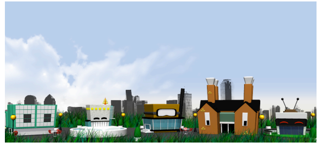
Figure 2: The five university buildings characterised as 3D models

For each building, three animations were created to illustrate states of energy consumption: ‘happy’ if lower than the defined ‘normal’ band, ‘neutral’ if within normal range and ‘sad’ if higher than normal. The animated animals reflected these states by appearing happy, neutral or sad (e.g. ‘sad’ penguins appeared lonely, with dead fish scattered around, ‘sad’ skies appeared darker with aircraft contrails, and some poorly-performing buildings exuded smoke).