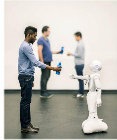
Figure 1. An illustration of Transfer Learning with an Assistive Robot.

In the case where F_S = F_T there can be a direct mapping from source to target to achieve transfer. This case is a much simpler case of TL where the challenges of what/when to transfer can be addressed with less computational effort. However, for example in applications such as human-robot interaction where a robot is required to learn an action from a human, this can be activities like pick and place objects in assisted living environments. The human and robot are considered as the source and target domains respectively. The differences in both feature spaces makes it not feasible for a direct mapping of features across the robot/human domains. This work assumes the robot domain needed for transfer of knowledge differs in feature space from that of a human, that is, F_S \neq F_T and therefore for TL across such domains we