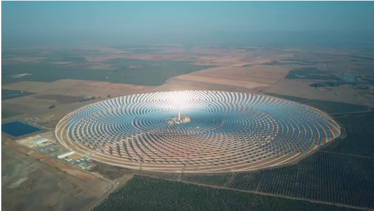
A concentrated solar plant near Seville, Spain. The mirrors focus the sun's energy on the tower in the centre.

Concentrated solar power uses lenses or mirrors to focus the sun's energy in one spot, which becomes incredibly hot. This heat then generates electricity through conventional steam turbines. Some systems use molten salt to store energy, allowing electricity to also be produced at night.