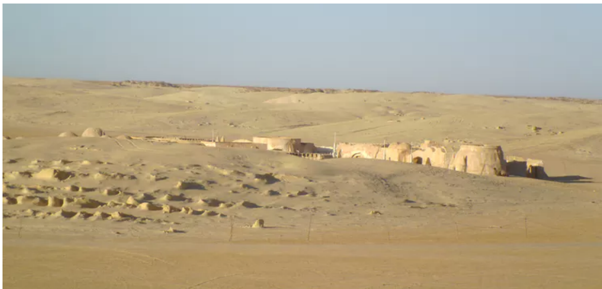
The planet Tatooine from the Star Wars movies was filmed in southern Tunisia.

Over the past decade or so, scientists (including me and my colleagues) have looked at how desert solar could meet increasing local energy demand and eventually power Europe too – and how this might work in practice. And these academic insights have been translated in serious plans. The highest profile attempt was Desertec, a project announced in 2009 that quickly acquired lots of funding from various banks and energy firms before largely collapsing when most investors pulled out five years later, citing high costs. Such projects are held back by a variety of political, commercial and social factors, including a lack of rapid development in the region.