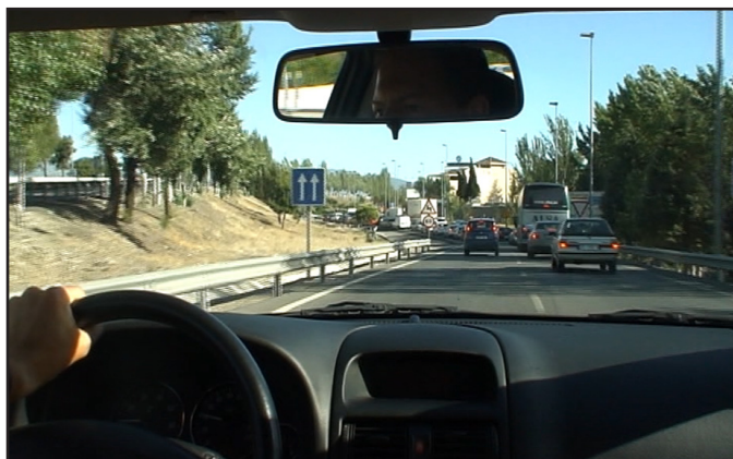
Figure 1: Naturalistic driving study: example view from in-cabin camera