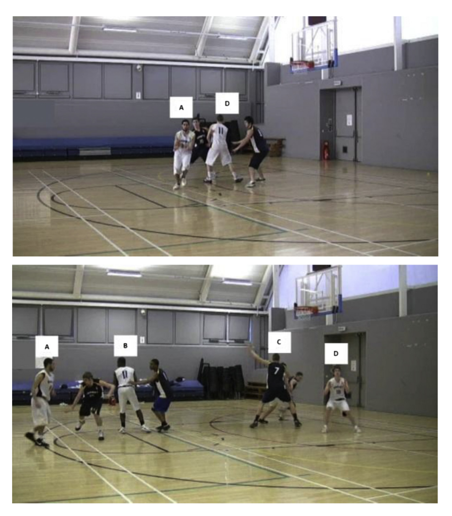
Fig. 1. Video stills depicting the design of the video stimuli used for the low-complex, two-choice response time (upper panel) and high-complex, four-choice response time (lower panel) tasks.

The task was designed and run on E-Prime (v. 2.0.1; Psychology Software Tools, Inc., Pittsburgh, Pennsylvania, US). Video sequences were presented on a computer screen viewed from a distance of approximately 0.5 m. Participants responded to each sequence by pressing one of two (low-complex trials) or four (high-complex trials) buttons positioned horizontally on a handheld response pad corresponding with players' on-court position (see Fig. 1).