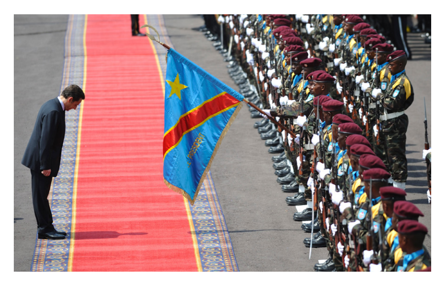
France's President Sarkozy reviews an honour guard in Kinshasa, 26 March 2009

The Democratic Republic of Congo (DRC) is home to risky contradictions: despite being very "rich" in natural resources, it remains consistently "poor" in solid and legitimate state structures. Europe conducts numerous efforts to strengthen Congolese social and economic infrastructures, offering security and governance support alongside more traditional development projects. But its actions suffer from situational ignorance, fragmentation, and policy frailty. A coherent and strategic (international) approach is urgently needed to provide valuable impetus to the most pressing Congolese needs.