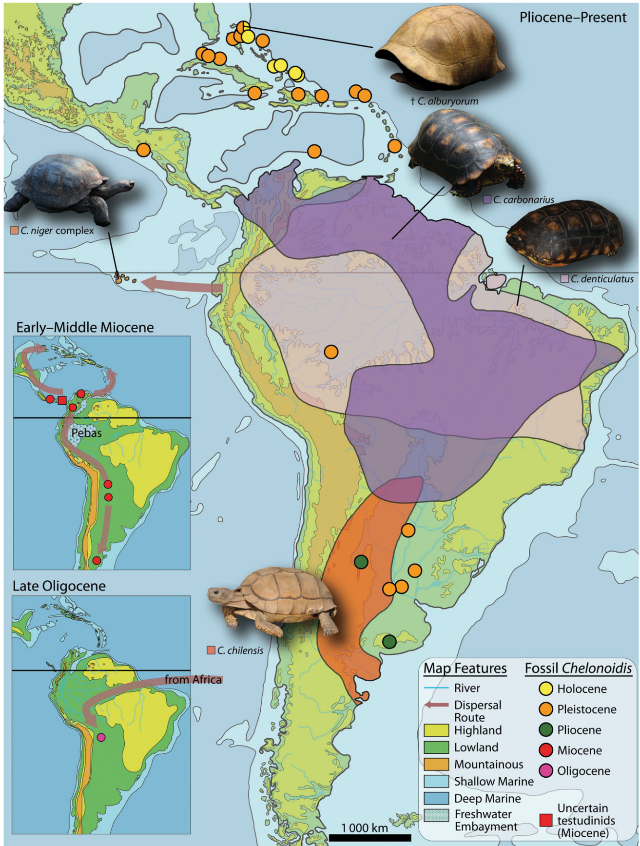
Figure 2. Extant and fossil occurrences of Chelonoidis and dispersals through time. For details, see electronic supplementary material, table S1.

by only approximately 7 mya and predates the divergence of Galápagos and Chaco tortoises by approximately 3.5 mya. Owing to human activities during the mid- to late Holocene, the entire Caribbean tortoise radiation was lost, as was the case for the sloths that once occupied the Greater Antilles [61]. This loss of the Caribbean tortoises is another example