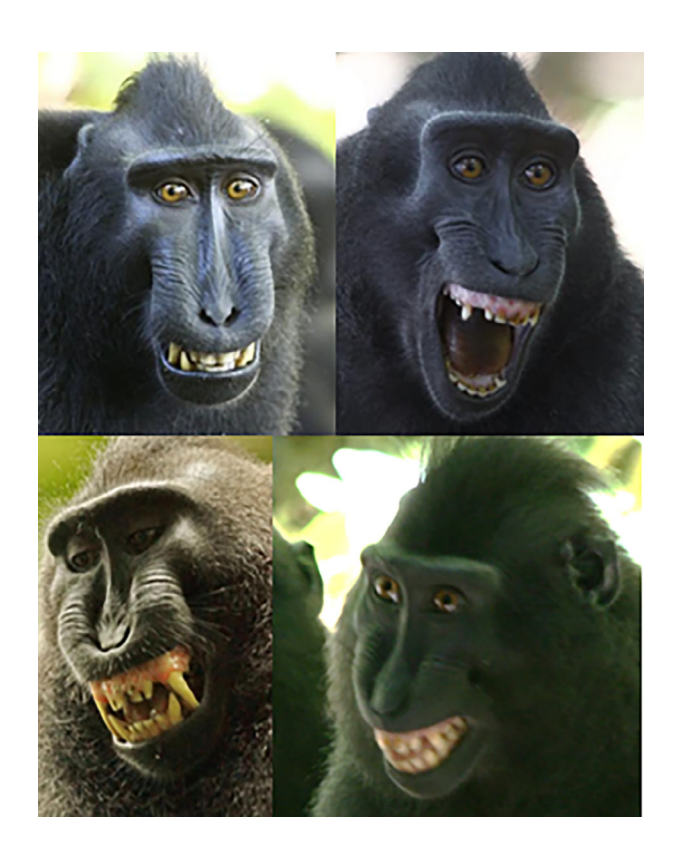
FIGURE 1 Examples of silent bared-teeth expressions produced in the four contexts. Clockwise from top-left: affiliation, play, submission, copulation

<sup>a</sup>Mean ± SD of 1,000 analyses of randomized weighted permutations of each dataset.