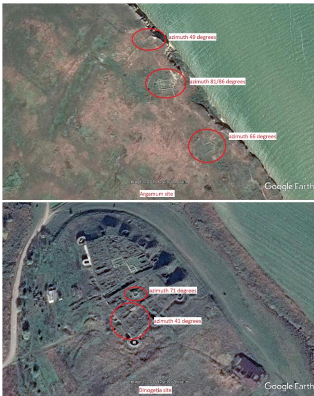
Figure 3. Satellite view of Argamum and Dinogetia sites.

not follow this template. Analyzing the second case we discover from archaeological investigations that the basilica predates the city wall which was modified to go around the apsis [15]. The wall was built by byzantine emperor Justinian (527-565 CE) and investigations performed by archaeologists in 2001 proved the existence of Greek housing remains dating from the archaic period (6th century BCE) in the area of basilica 3 which is also located inside the city walls. Detailed excavations around basilica 3 are however not possible due to the existence of numerous roman and byzantine artefacts in upper layers. Investigations at basilica 1, our subject, indicate that the solid rock is only 0.1-0.35m beneath the ground level.