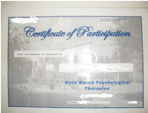
Figure 2: Patient photographs of certificates and goals

On the use of the whiteboard, the patient commented: