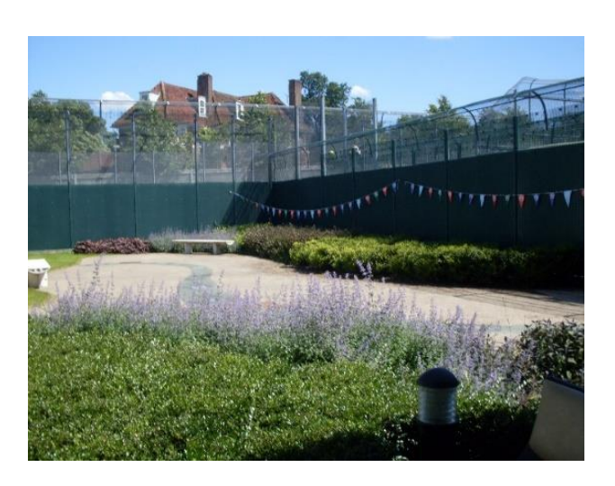
Figure 1: Forensic unit garden

The space in this photograph is a complex and contradictory one. In the foreground, there is a well cultivated garden featuring a bench, seemingly positioned for quiet reflection. Beds of lavender evoke repose and restoration. Flags indicate a sense of community and celebration. As the eye travels up the image, however, the height of the surrounding fences troubles this peaceful picture. Upon closer inspection these fences are not only high, but hostile and laced with barbed wire. Whether designed to keep the world out, or the users of the garden in, these fences stand in stark contrast to the restorative garden below. Threat of harm, whether past or potential, permeates the space; what else could have necessitated such intimidating structures.