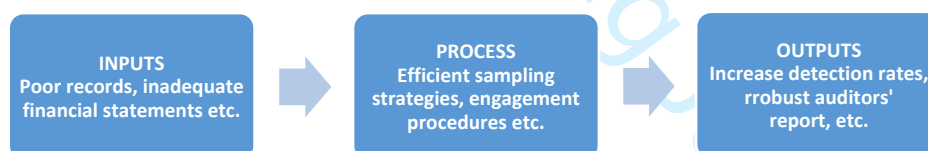
Figure 3 – Input-Process-Output Framework

Figure 3 illustrates the inputs of auditors are listed among other financial records, accounting transactions, complete ledger, and others. While the process of auditing (Figure 3) is robust sampling strategies to increase detection rates of frauds and corruption, audit engagement, substantive procedures and others. The process also includes regular training for auditors and continuous professional development (CPD) of auditors to lower non-detection risks. Lastly, the outputs of auditing comprise robust auditing reports to successfully detect fraud and corruption, which will subsequently lead to the country’s stability.