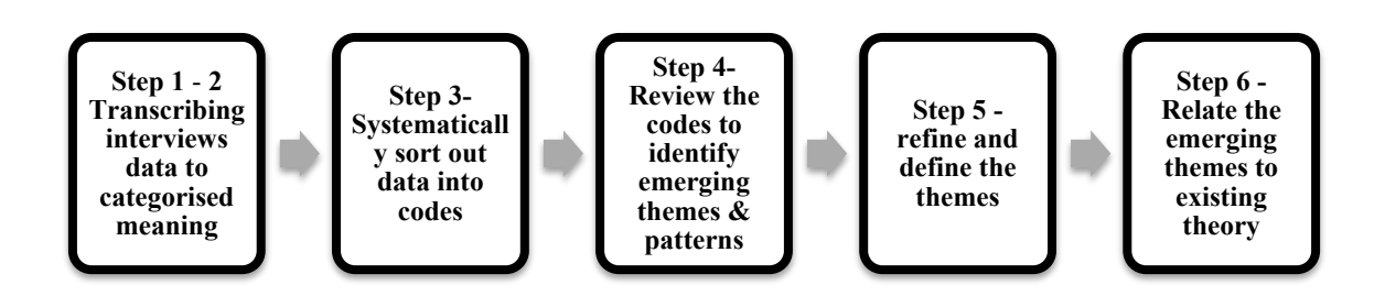
Figure 2: Coding Process Adapted from (Braun and Clarke, 2008)