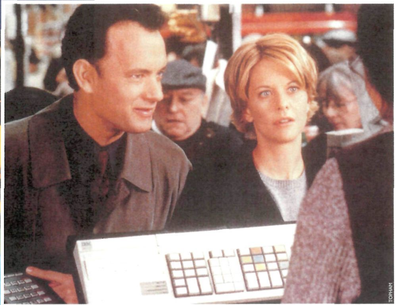
Tom Hanks and Meg Ryan in the film You've got Mail .