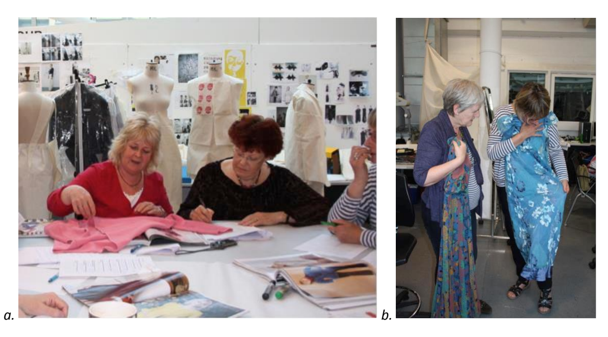
Figures 4 a-b Participants discussing their favourite items.

Alongside this activity, the participants had a chance to look at current fashion magazines such as Another Magazine, Vogue and Elle, and relate their needs and tastes to the various images, editorials and adverts presented in these publications. This provided a platform for our participants to directly compare the fashionable clothes on offer with items of clothing that are actually present in their wardrobes. Once again, for many this was a chance to express their dissatisfaction with the fashion solutions currently available on the market. On the other hand, these women presented a high level of creativity and widely commented that in fact they would buy some of these products but modify them according to their own needs, for example, by adding sleeves or elongating the shape of a garment. Overall, the