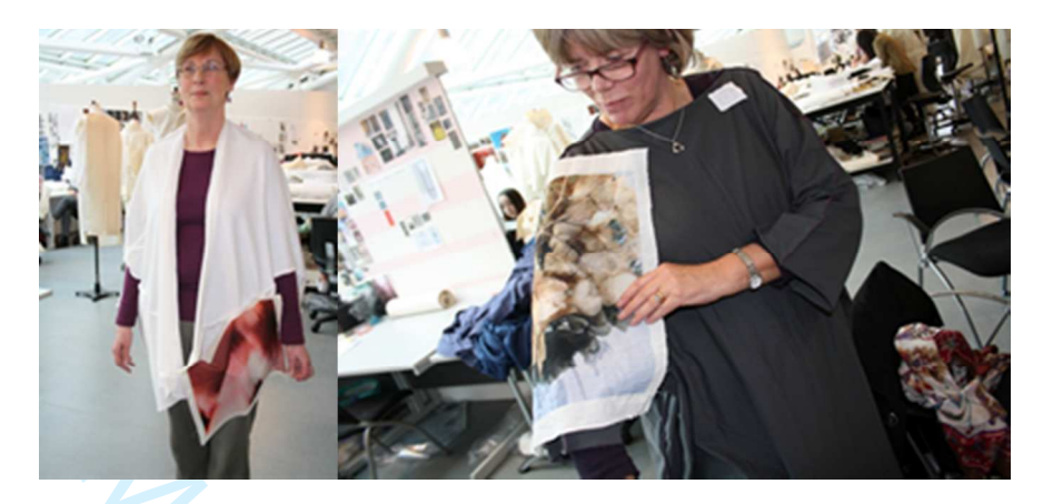
Figure 5. Workshop 4: Participants trying on the Triangle Jacket and Rectangle Dress toiles and selecting print designs.

Phase 2 of the project culminated in the production of 30 garment prototypes (between June 2016 and April 2017) in contrasting textiles, including: Rectangle Dress 1, Triangle Dress, Jacket (fig. 6), coordinating tops, tunics and trousers in Small (8-12), Medium (12-16) and Ample (16-20). Rectangle Dress 2, Circle Top, and Circle Dress were produced in One-Size. The resulting garments were tested through a series of fittings, 'trying on' sessions and photo shoots with a professional photographer and finally modelled by 14 of the participants in a public dissemination event, held in April 2017, during Phase 3 of the project. The Emotional Fit salon was organised in association with Fashion Revolution Week to raise awareness of the older women's support for sustainable design (fig.7).