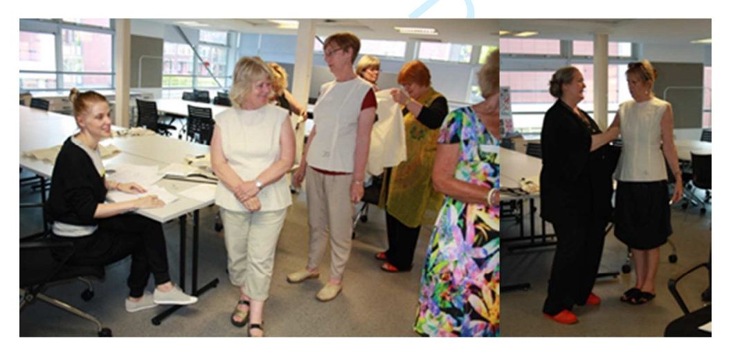
Figure 3. Workshop 2: the participants trying on the bespoke calico bodices, produced to their individual measurements and according to UK sizing charts (British Standards Institute, 2001).

Workshop 2 was conducted in June 2015 and was attended by 21 participants, who together with the researchers explored the exchange of ideas based on the group's "diffuse and expert knowledge" (Manzini 2015, p.37). Firstly, participants were introduced to the principles of geometric pattern cutting, an approach selected to accommodate multiple body shapes and preferences emerging from the study, while minimizing waste (Rissanen and McQuillan, 2015). Secondly, returning participants tried on the calico bodices (figure 3), constructed in relation to their body measurements (acquired in Workshop 1) cross-referenced with those from UK British Standard sizing charts (British Standard Institute, 2001). The development of 'live' blocks was the first stage of developing prototypes in line with the women's individual shape and style (Aldrich 2004, p.4). New participants were measured, their garments and preferences recorded to build on the data from Workshop 1.