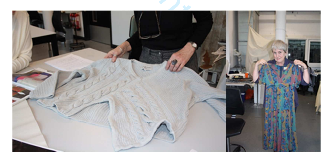
Figure 2a-b. Workshop 1: Recording a favorite garment; Show and tell.

In order to build on the qualitative data accrued in Workshop 1, a series of in-depth semistructured interviews were undertaken with five participants in June and July 2015. Following the requirements of IPA, the selection process was based on the participants' suitability in terms of their