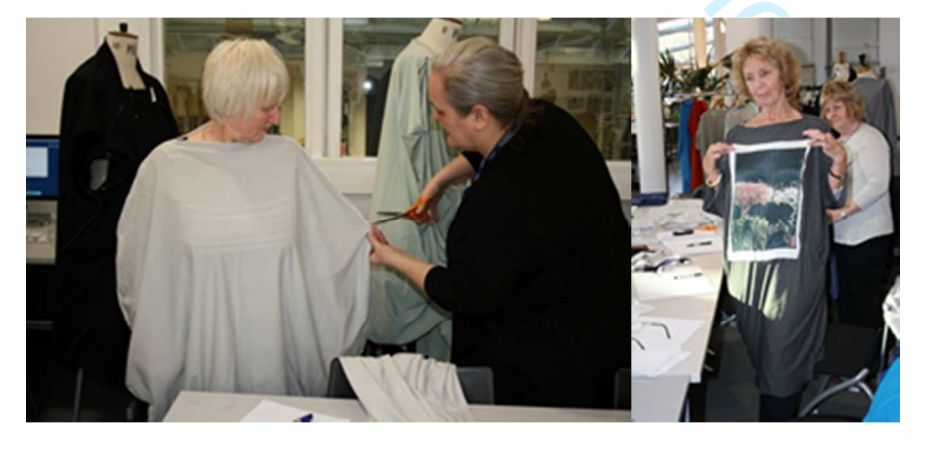
Figure 4. Workshop 3: A researcher adapting a toile; trying on toiles and selecting prints.

The second phase of research culminated in two co-designing workshops (3 and 4), which were similarly structured and conducted in March and April 2016. Following IPA's commitment to idiographic, inductive and interrogative analysis the aim of the workshops was to elicit the 'means' of how fashion actors are engaged in particular forms of interaction, and the eventual 'ends' of experiential value that are co-created (Smith et al 2009). Consequently, participants worked collaboratively in each workshop with the researchers to develop a capsule collection, which effectively responded to the practical, emotional and ethical issues raised. This involved hands-on practical exercises, where toiles and printed textile swatches were tried on, manipulated and selected by the participants, facilitating the design development process (figs 4 and 5).