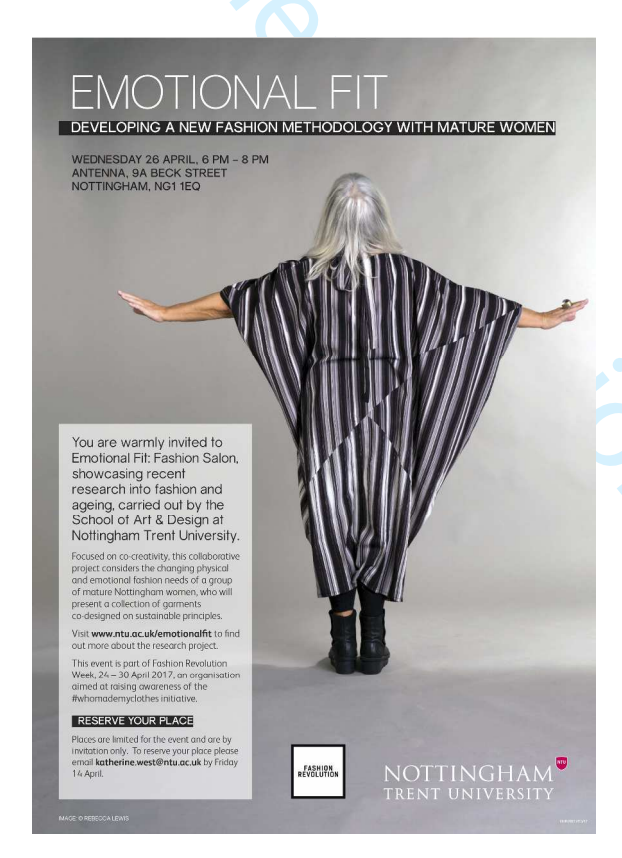
Figure 7. Triangle Dress (Stripe) on Emotional Fit: Fashion Salon advertisement

Workshops 3 and 4 were crucial in determining textile and shape selection for garment prototypes, produced to visualise, test and disseminate the research. The co-designing process involved potential customers mapping their design preferences into the material domain of a garment (Fiore et al. , 2001). Feedback on aesthetics found that while some prints were universal in their appeal, others were preferred as panels or linings to augment personalization in line with an "artisanal approach" (Aakko 2016). Generally, large-scale patterns were preferred over small repeats, pockets were essential and ties and drawstrings allowing for multiple styling options were popular. The key findings from Workshops 3 and 4 revolved around the importance of facilitating the conditions for empirical research by providing the opportunity for all stakeholders to explore their natural and professional designing capabilities (Manzini 2015, p.37). Participants attending the Phase 2 workshops reported that it was only through active engagement in co-designing that they felt their specific needs and expectations were being considered. Furthermore, they reflected on how being involved in the inclusive and transparent process of publicly modelling the garments enhanced their sense of 'agency' (Goode 2016), allowing them to develop a more positive attitude towards themselves and the concept of fashion (Niinimaki and Koskiken, 2011).