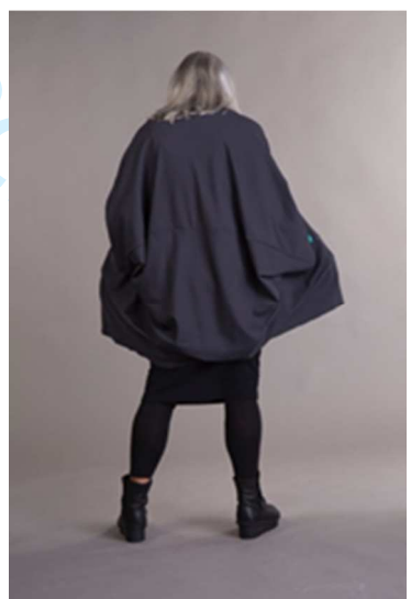
Figure 6. Rectangle Dress; Triangle Dress (Orchid) and Triangle Jacket