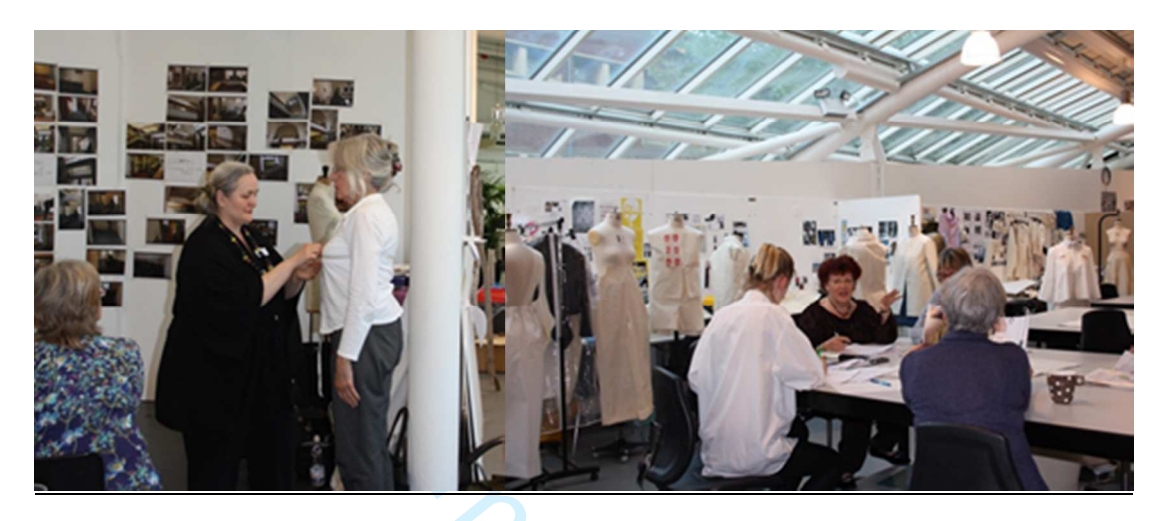
Figure 1a-b. Workshop 1: Taking body measurements; Small group discussion.

while establishing insights into individual aesthetic preferences, alongside technical details of existing clothing: silhouette, style, cut, length; colour, pattern, texture. The resulting qualitative data consisting of personal disclosures of attitudes, opinions and intentions towards fashion (Wilkinson, 2003) was supplemented with quantitative measurements.