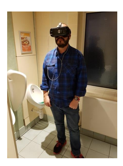
Figure 2 - One of the UKPT trustees testing out the VRET

In the weeks following the focus group five of the participants contacted the researcher, expressing an interest in future involvement with the project and reviewing future prototypes. One participant stated, "I have a Gear VR at home and if you can build something more specific for the triggers that affect me, please let me know"