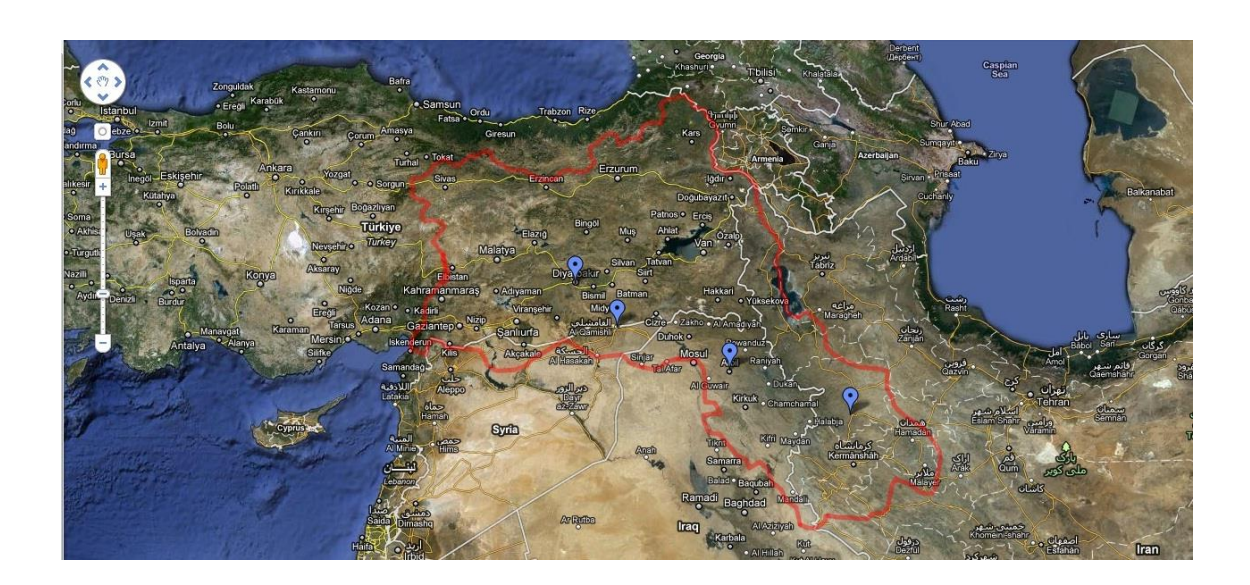
Figure 2.1: Map of Greater Kurdistan according to Google Map

The Kurdish question mostly began after the collapse of the Great Ottoman Empire in World War I, when the Ottoman government was forced to sign the Treaty of Sevres in 1920. Article 64 of the Treaty granting the Kurds the right to have their independent state of Kurdistan in the future. This treaty was considered as a clear victory for Kurds because it was the first international agreement that supported the Kurdish rights to autonomy. However, Mustafa Kemal Ataturk rejected the process of the Sevres Treaty, and a new peace conference resulted in a new treaty, which known as the Treaty of Lausanne, in 1923. In this treaty, the Kurds' right to autonomy was completely neglected, which put an end to Kurdish ambitions for independence. Eventually, as a consequence of the Lausanne agreement and after the World War I, Kurdistan officially divided into four territories among Turkey, Iran, Iraq, and Syria (see figure 2.1) (McDowall, 2003; Sheyholislami, 2011; Hogan & Trumpbour, 2013; Yıldız, 2004; Wanche, 2002).