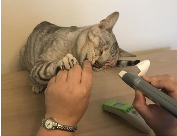
Figure 4. Resistance to eye temperature measurement: cat refusing to hold eye open (operator using treats to encourage compliance)

Figure 4. Resistance to eye temperature measurement, cat refusing to hold eye open (operator using treats to encourage compliance).