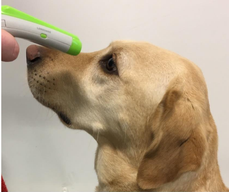
Figure 3. Rycom thermometer measuring eye temperature on an unrestrained dog.

Figure 3. Rycom non-contact thermometer measuring eye temperature on an unrestrained dog.