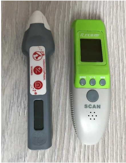
Figure 1. The Thermofocus Animal (left) and Rycom (right) non-contact infra-red thermometers.

Figure 1. The Thermofocus Animal (left) and Rycom (right) non-contact infrared thermometers.