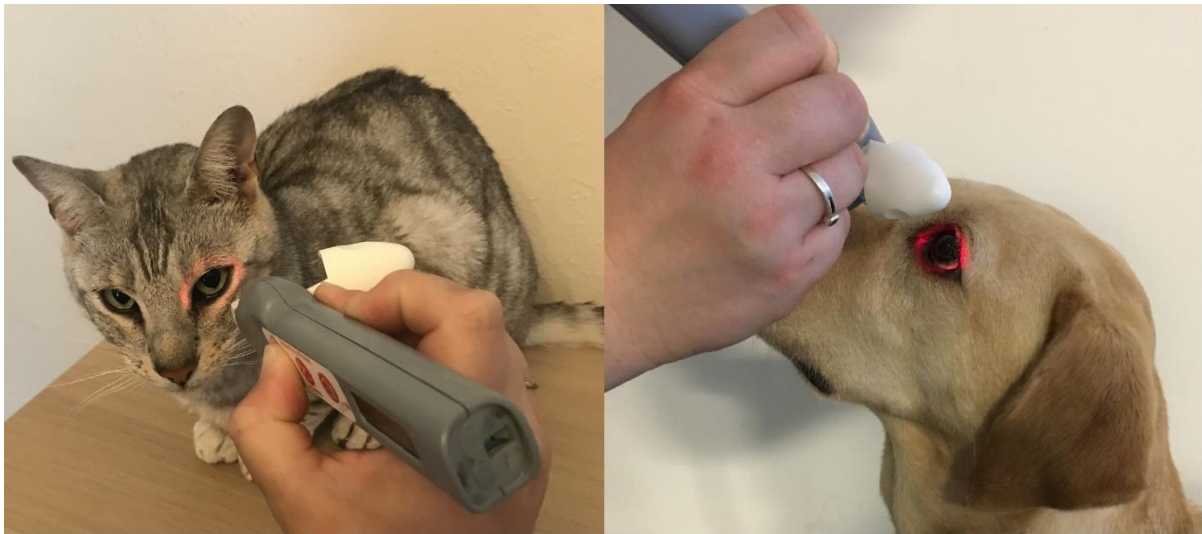
Figure 2. The Thermofocus Animal non-contact thermometer uses red LED guide lights to determine optimal distance from the eye of the patient.

Eye temperature (ET) was measured using two animal specific NCIT devices, the Thermofocus Animal non-contact thermometer (Technimed, Vedano, Italy), and the Rycom non-contact infrared thermometer for pets model RC004T (Guangzhou Jinxinbao Electronic Co. Ltd, Guangzhou, China). The Thermofocus thermometer uses LED light guides to indicate the ideal distance for temperature measurement (see figure 2), the Rycom thermometer should be held between 2-5cm away from the surface being measured (see figure 3). A 'lo' reading is given when the NCIT devices records a temperature below 32.0°C. In the event of a 'lo' reading, the measurement was repeated, if the subsequent reading was also 'lo', this was recorded as a missing data point due to "lo" reading. Both devices require calibrating for 30 minutes following any changes in ambient temperature. For the feline study, the thermometers were stored in theatre to ensure no sudden changes in conditions. For the canine study the thermometers were taken out of the car 30 minutes prior to any temperature readings to allow calibration. For both studies eye temperature (ET) was measured once, on the eye most readily accessible to the operator.